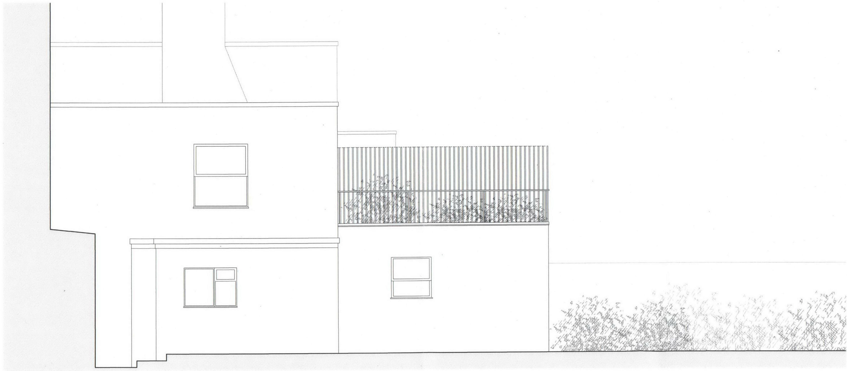
existing south elevation (1:50 @ A3)