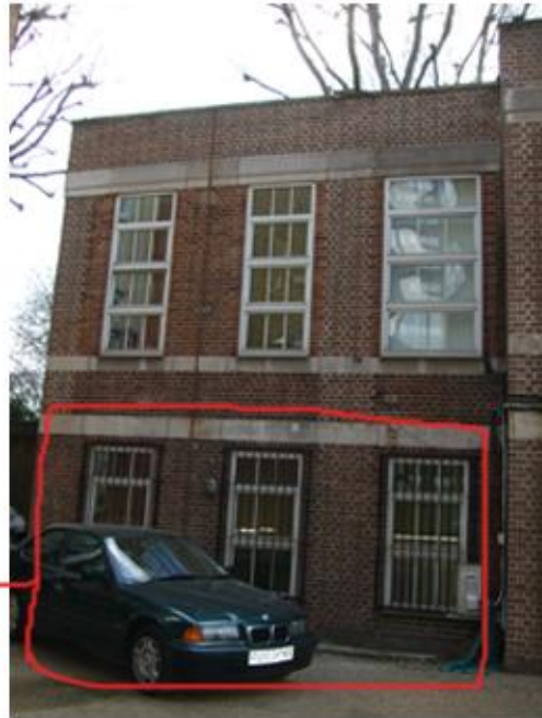
Two louvres and one fire escape door