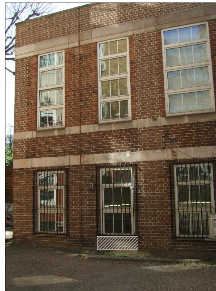
SITE PHOTO SCALE N/A Opening to extended