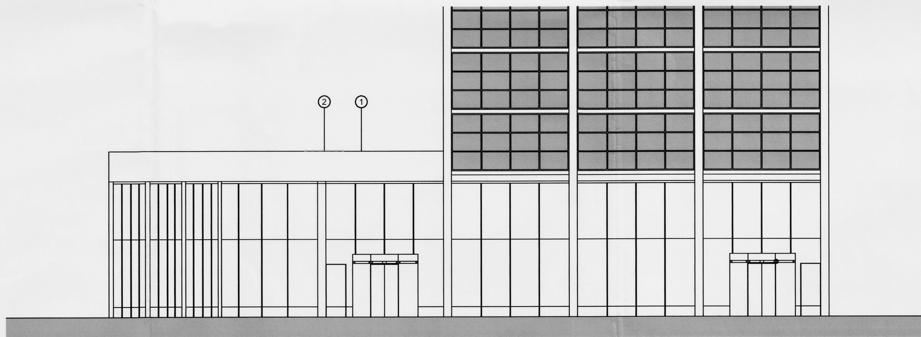
Proposed Hampstead Road Elevation

0m 1m 2m 3m 4m 5m 0.5m 1.5m 2.5m 3.5m 4.5m