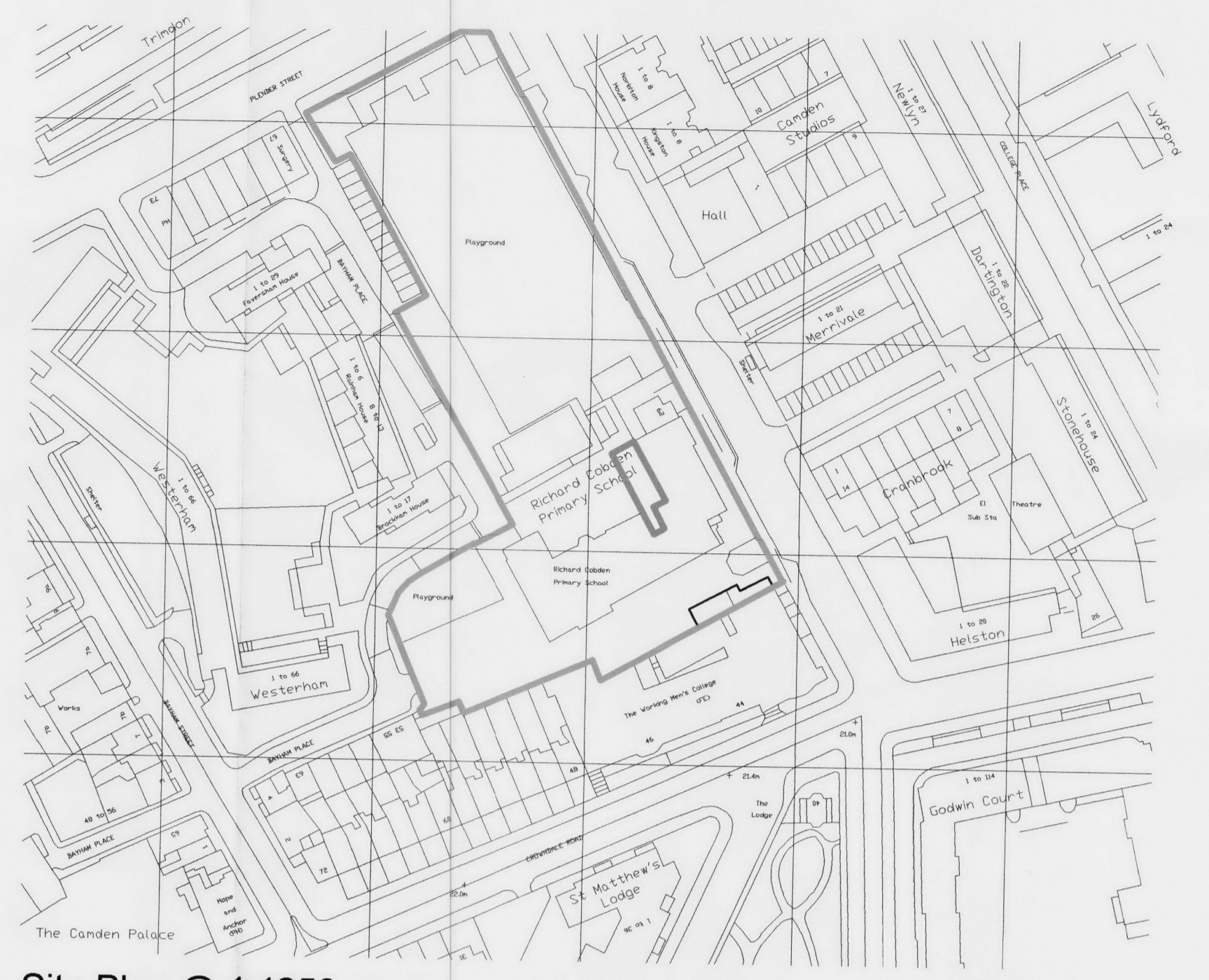
Site Plan @ 1:1250