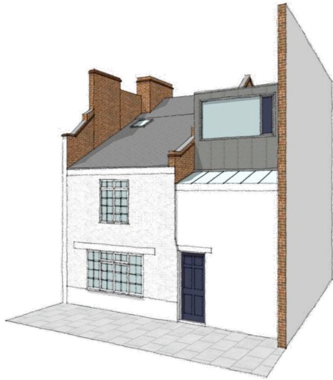
VIEW FROM COLLEGE LANE