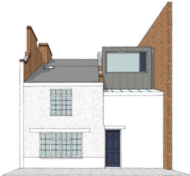
ELEVATION ONTO COLLEGE LANE