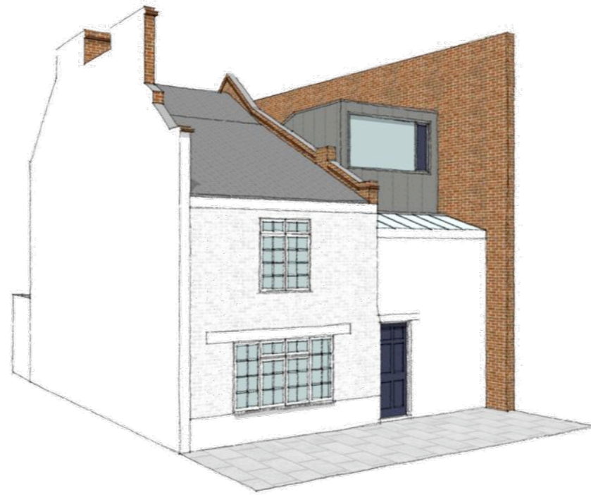
VIEW FROM COLLEGE LANE