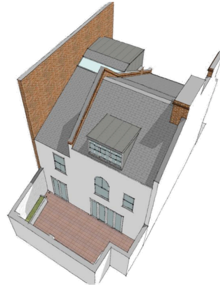
AERIAL VIEW FROM THE SOUTH