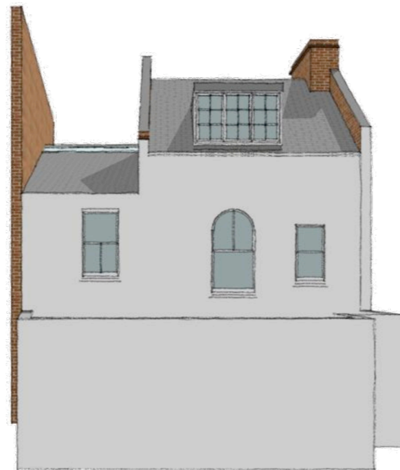
ELEVATION FROM HIGHGATE ROAD