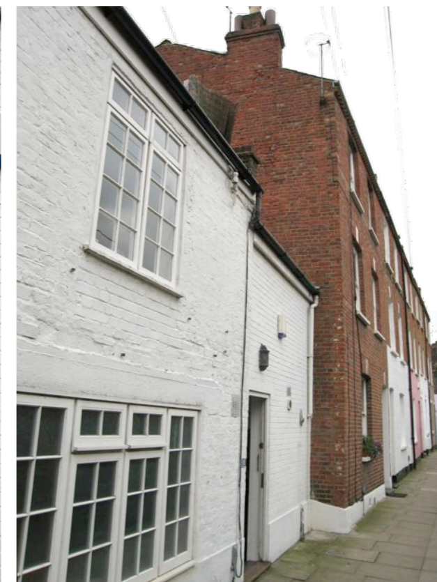
ELEVATION ON COLLEGE LANE