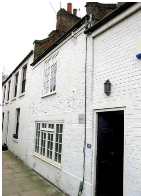
ELEVATION ON COLLEGE LANE