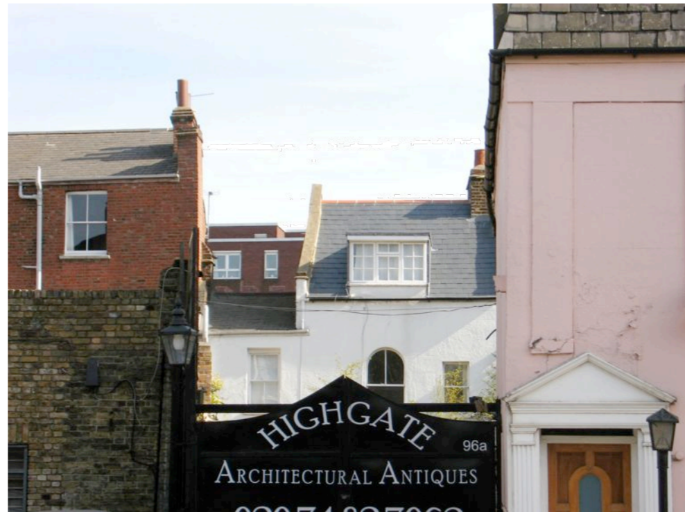
ELEVATION FROM HIGHGATE ROAD