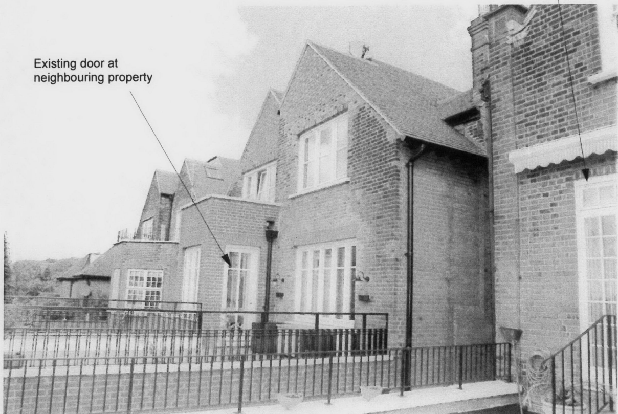
Image 3 - neighbouring property with similar door opening