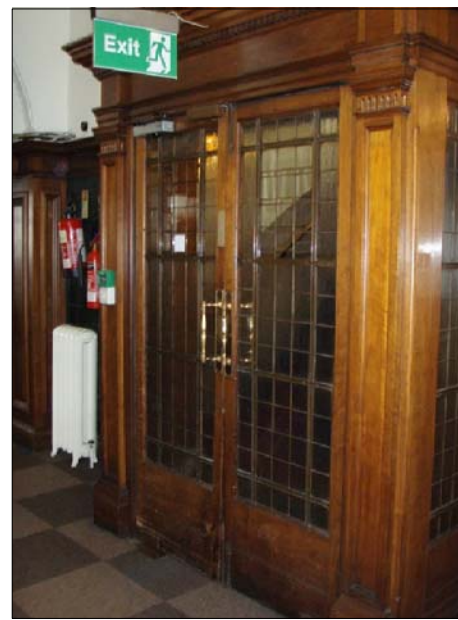
P01 PHOTOGRAPH OFFICE ENTRANCE DOORS