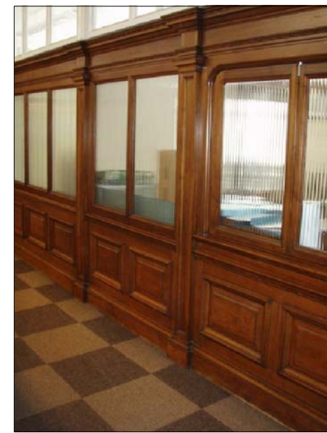
P02 PHOTOGRAPH TIMBER PARTITIONS TO SMALL OFFICES

The areas on the drawing have been measured directly from a CAD drawing and have no tolerances added or subtracted.