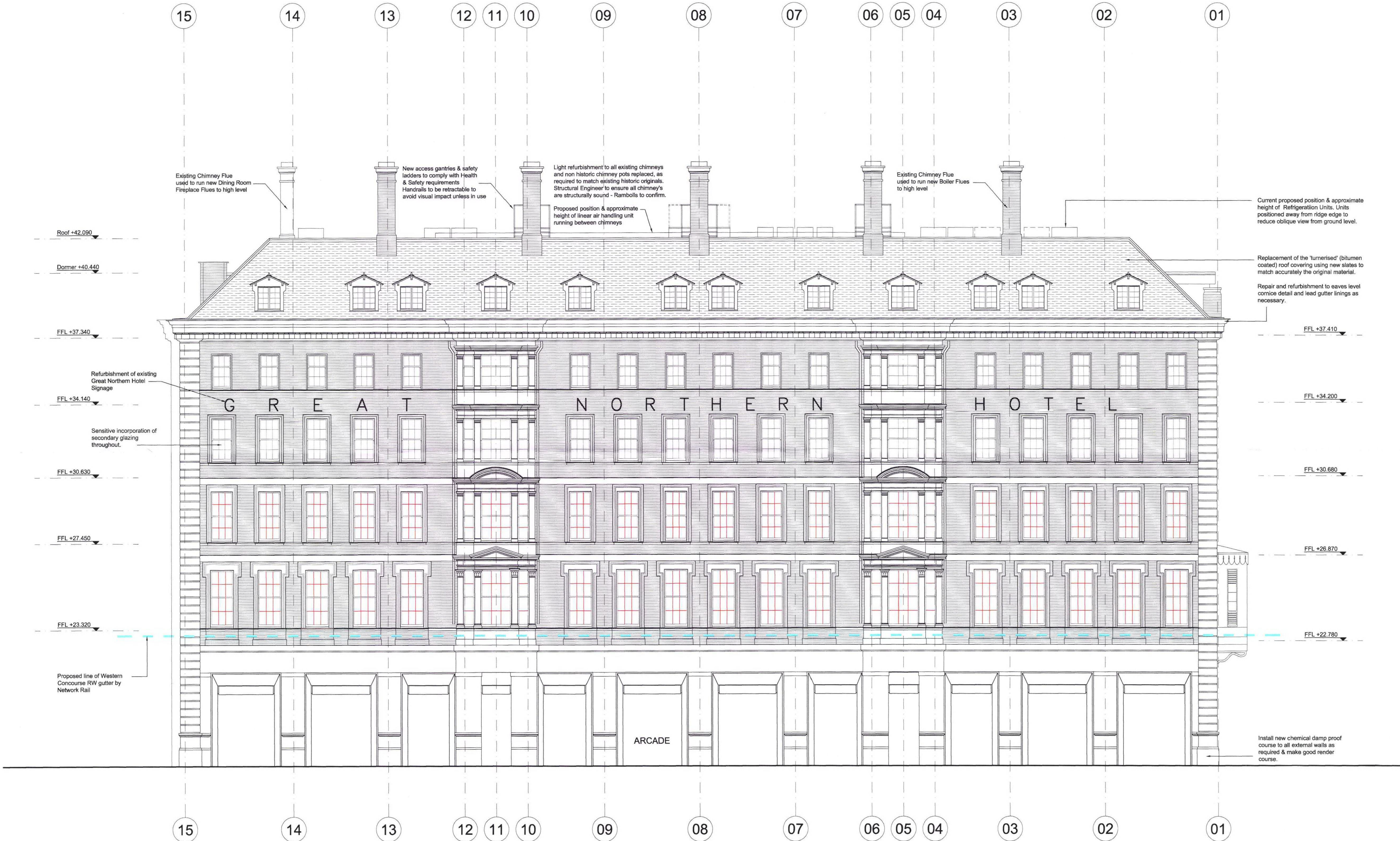
North East Elevation Scale 1:100 @ A1 (1:200 @ A3)