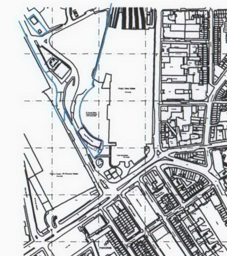
Location Plan Scale 1:8000 @ A3

Blue Line - Adjoining land owned or under the control of the applicants