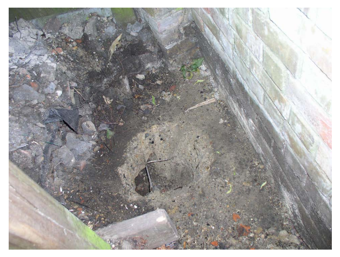
Photo No. 6 Trial hole at the rear were concrete slab was discovered.