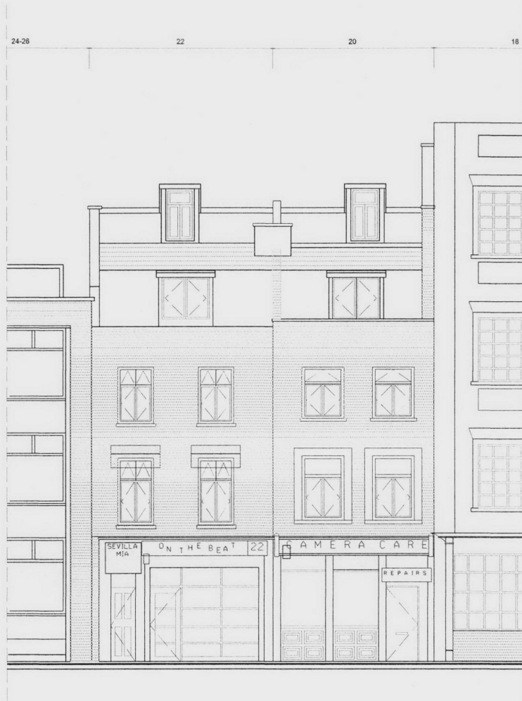
07 A HANWAY STREET (FRONT) ELEVATION AS EXISTING