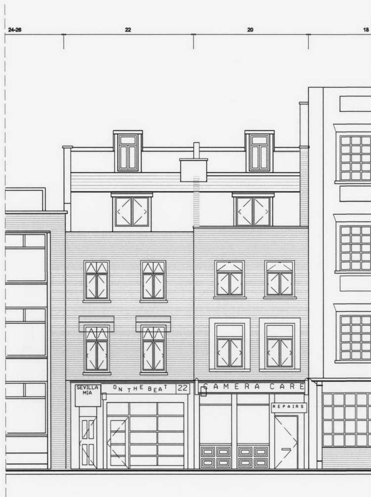
07 A HANWAY STREET (FRONT) ELEVATION AS EXISTING