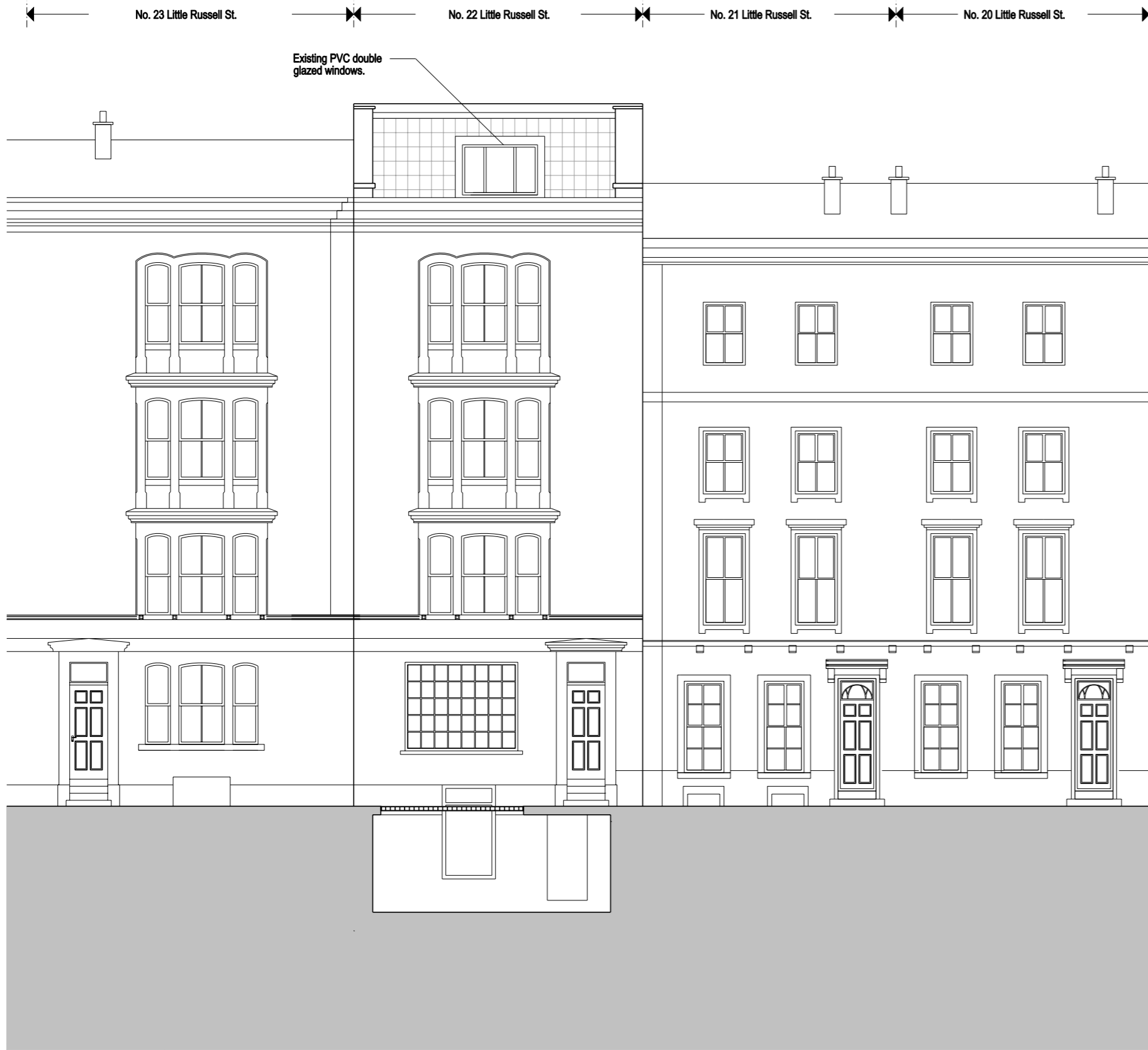
Little Russell Street Elevation