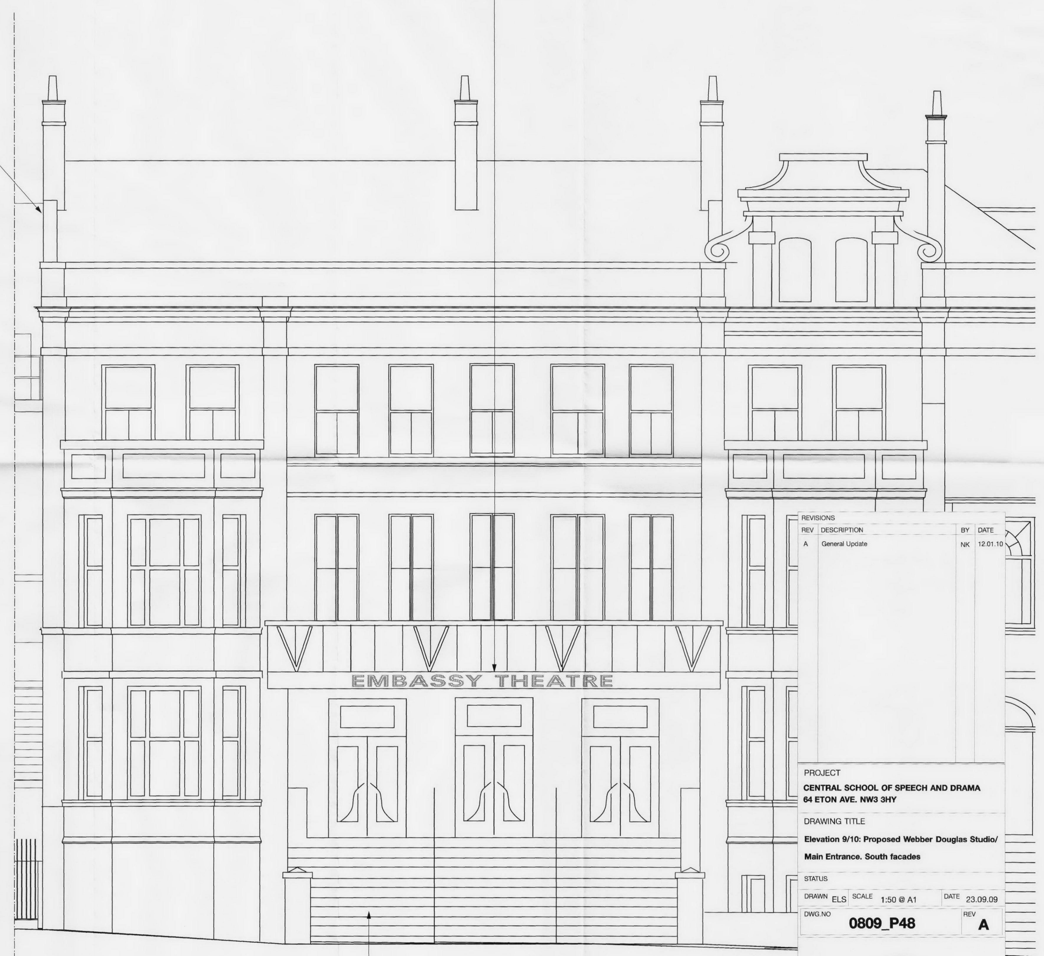
ELEVATION 9 EXISTING EMBASSY STUDIO/ WEBBER DOUGLAS STUDIO SOUTH SCALE 1:50@A1