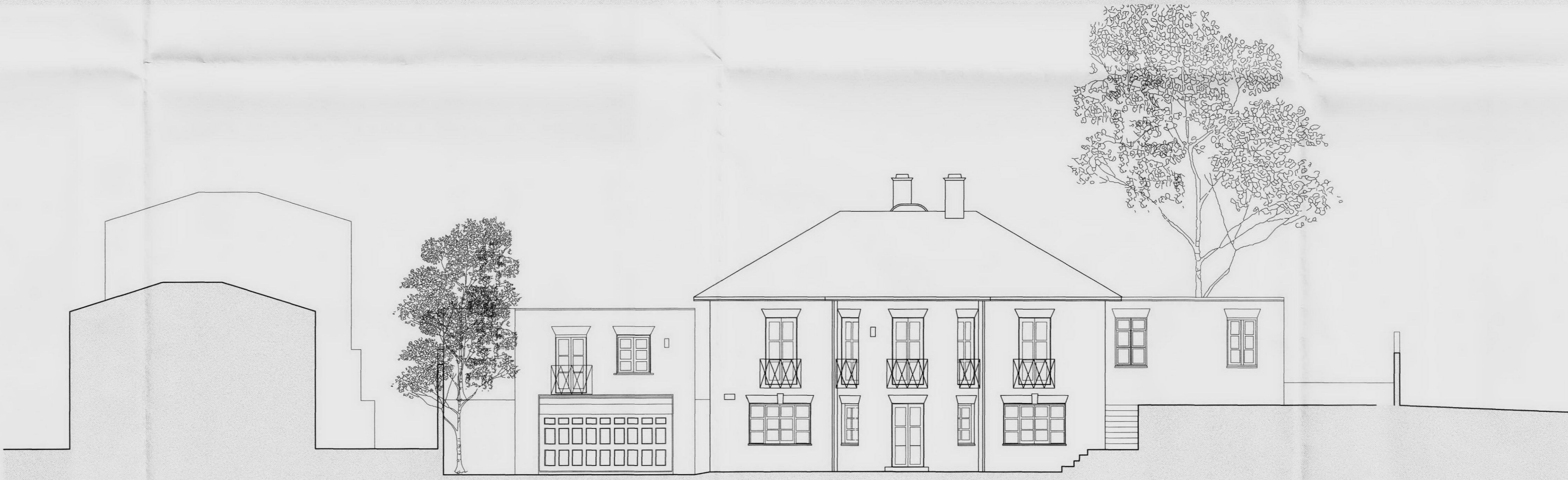
Existing East Elevation