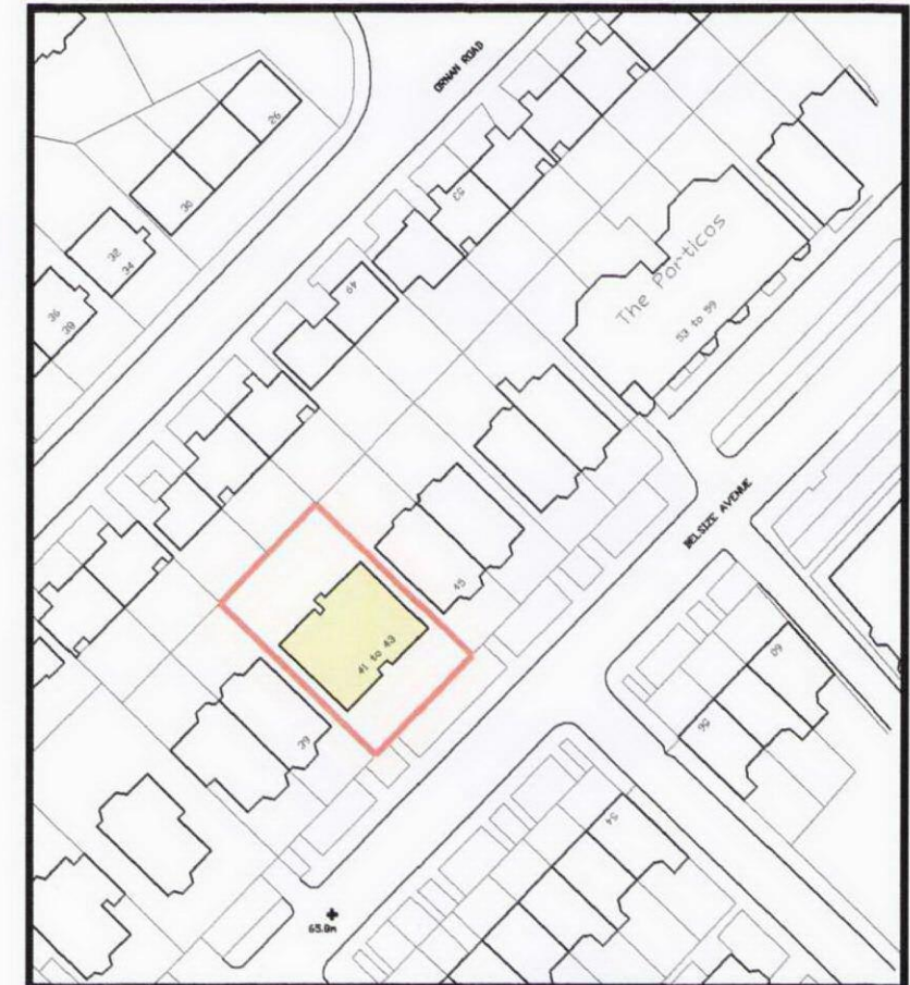
SITE PLAN SCALE 1:1250