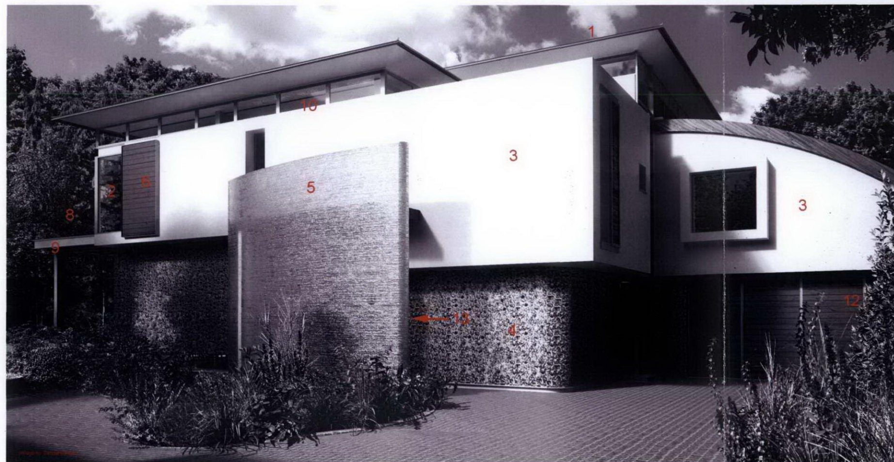
North East Perspective

1. Sedum roof with green zinc tray perimeter trim and off-white composite eaves soffit