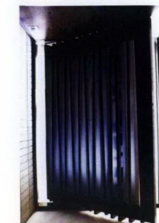
13. Front Door