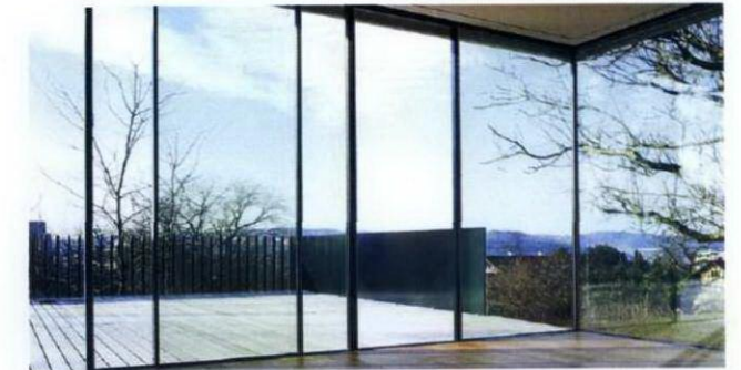
2. Fixed & Sliding Double glazed doors with Slim profiles

13. Front door Full height Solid timber and Steel door