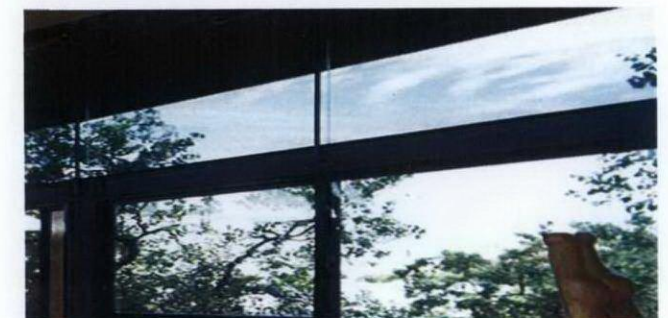
10. High Level Windows