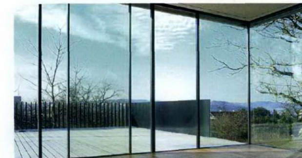
2. Fixed & Sliding Double glazed doors with Slim profiles

13. Front door Full height Solid timber and Steel door