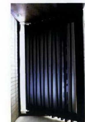
13. Front Door