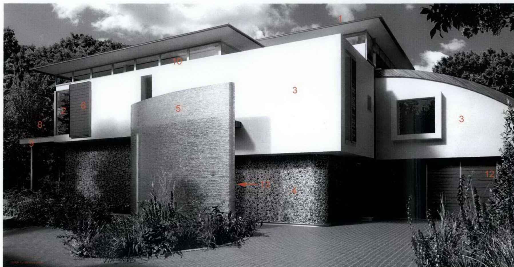
North East Perspective

1. Sedum roof with green zinc tray perimeter trim and off-white composite eaves soffit