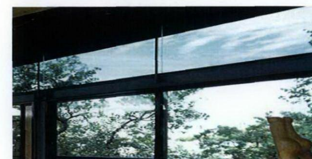
10. High Level Windows