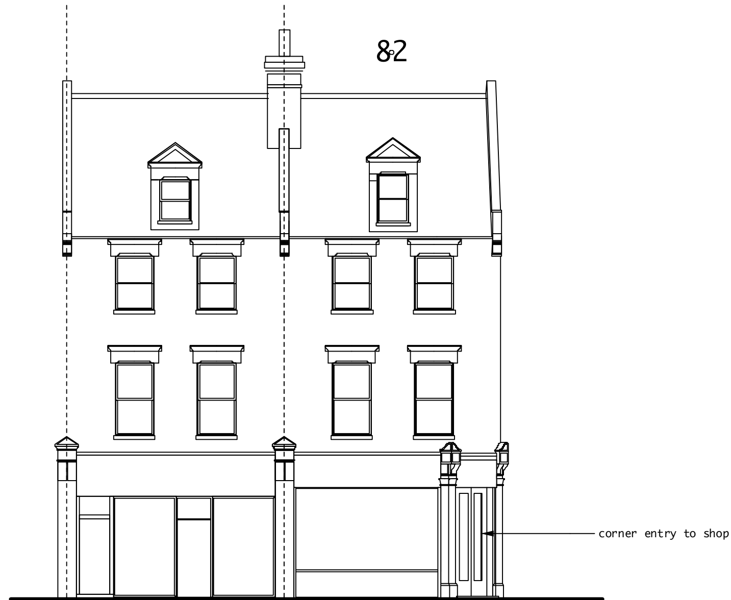
1 Mansfield Rd elevation Scale: 1:100