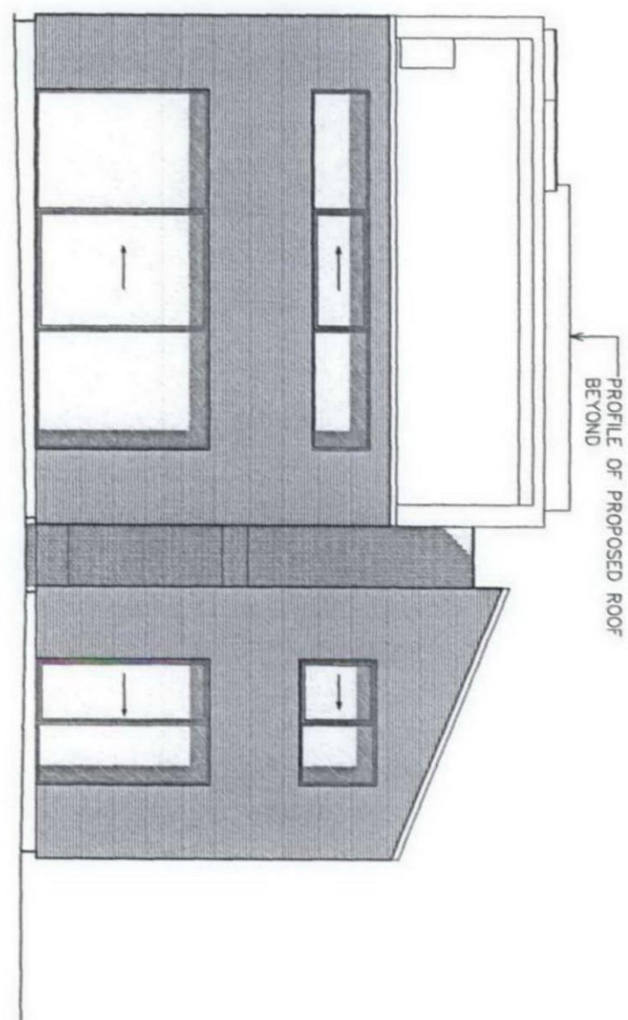
2 PROPOSED WEST ELEVATION