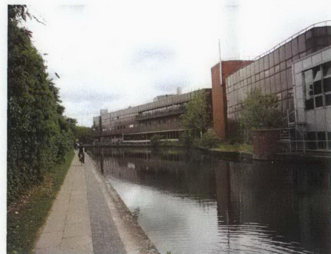
EXISTING WIDE ANGLE