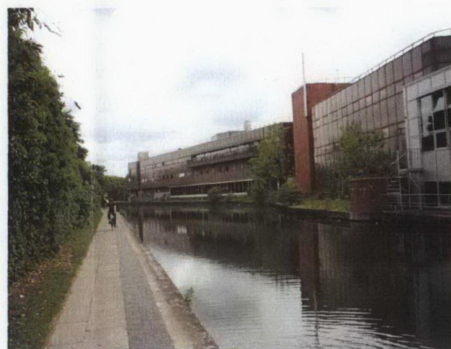
PROPOSED WIDE ANGLE