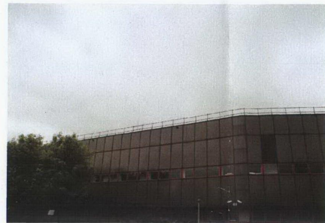
EXISTING WIDE ANGLE