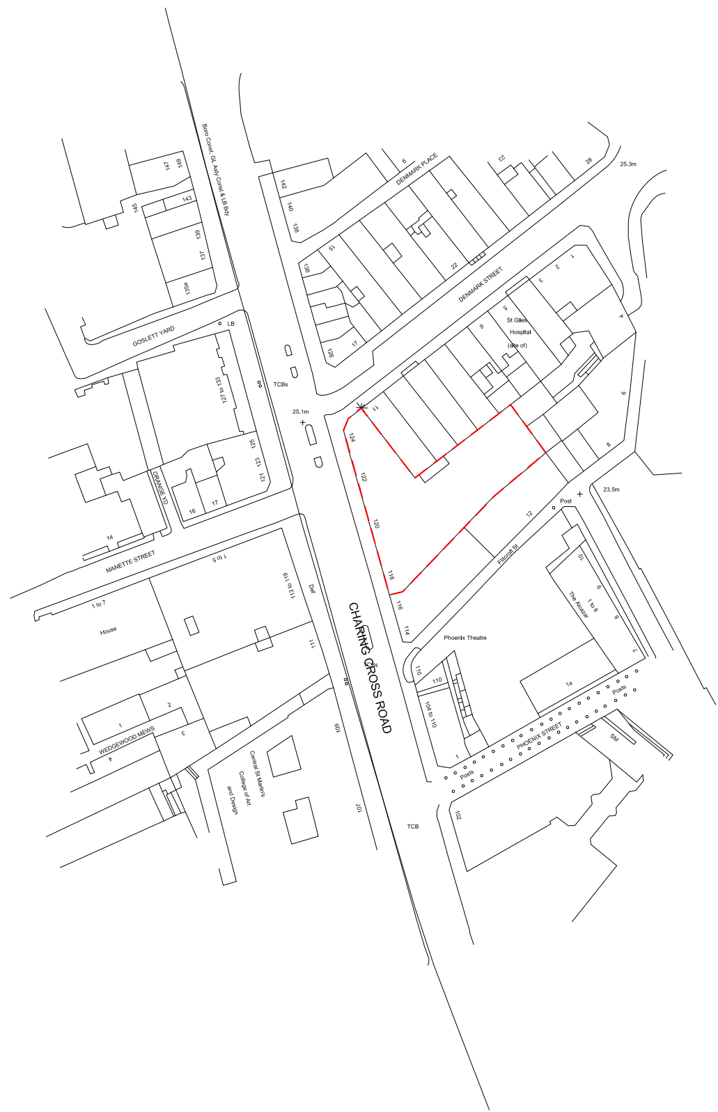
SCALE 1:1250 ORDNANCE SURVEY