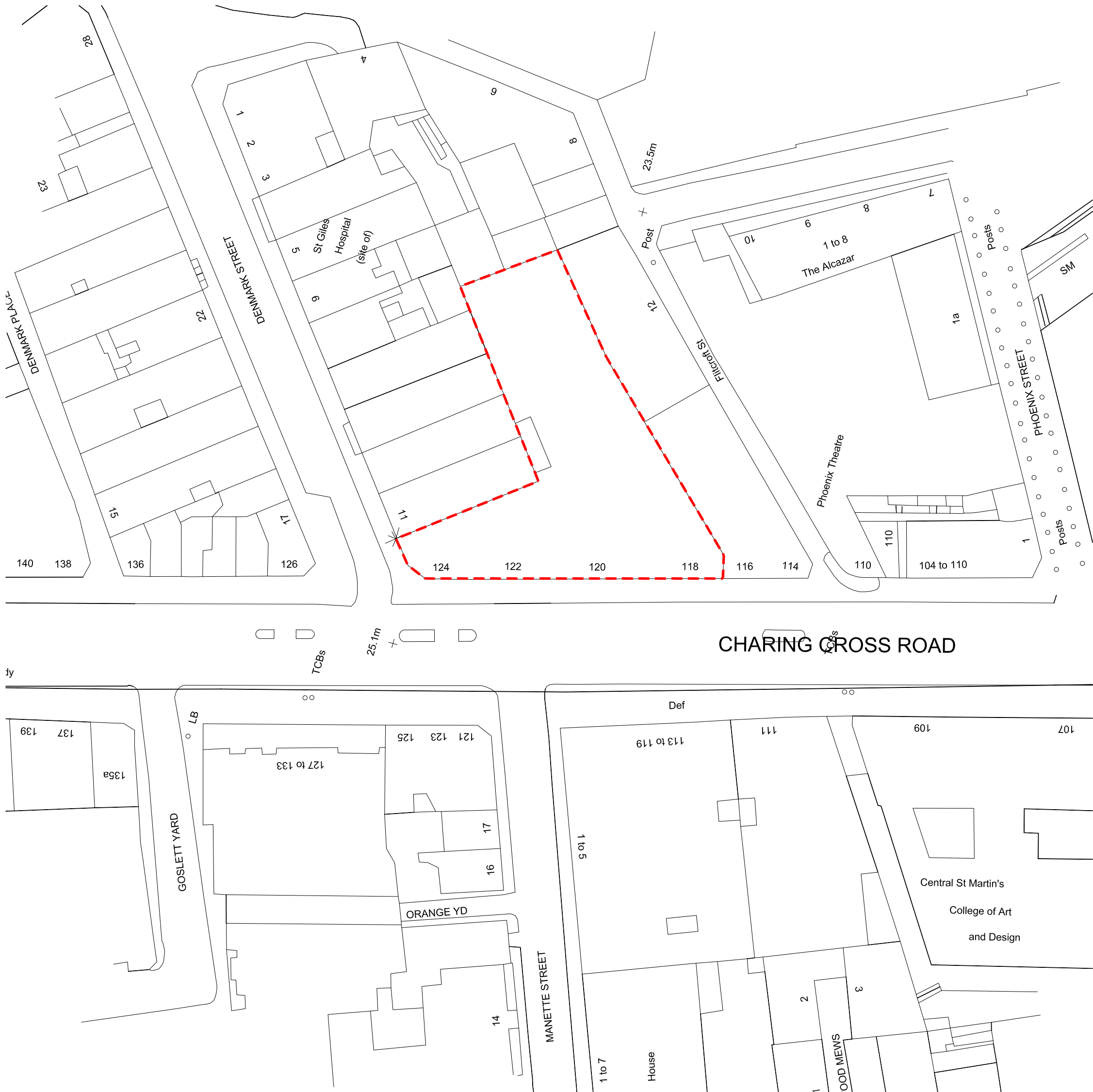
SCALE 1:500 SITE LOCATION