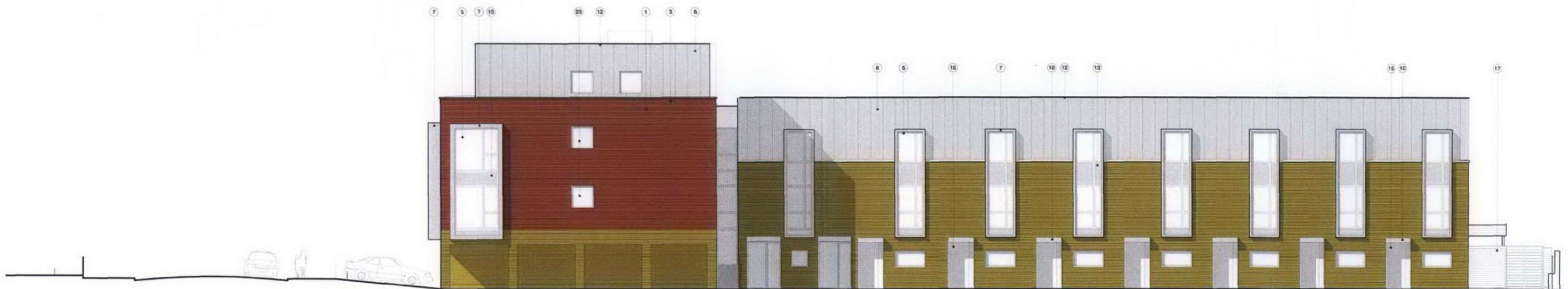
NORTH ELEVATION (BLOCKS C AND D)