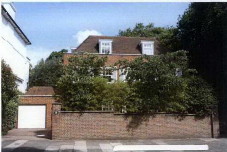
-Front View from Queens Grove