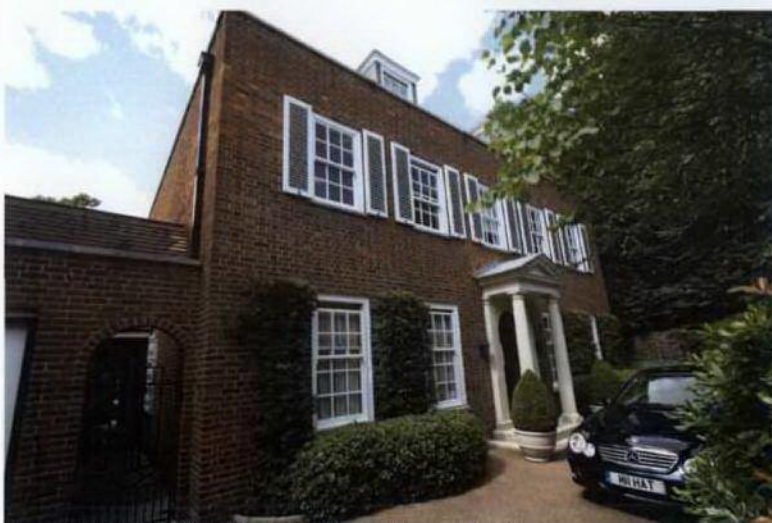
-Front View of 38 Queens Grove from Driveway