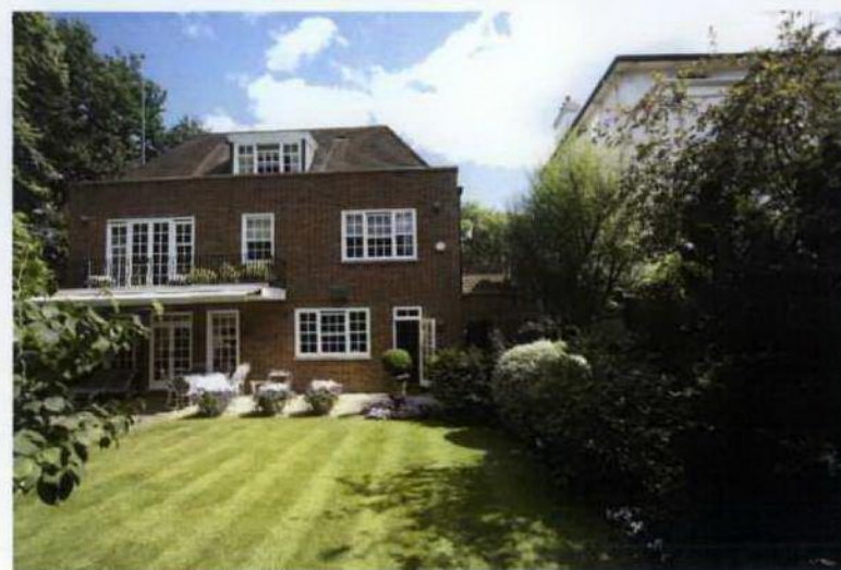
-Rear View from Gardens