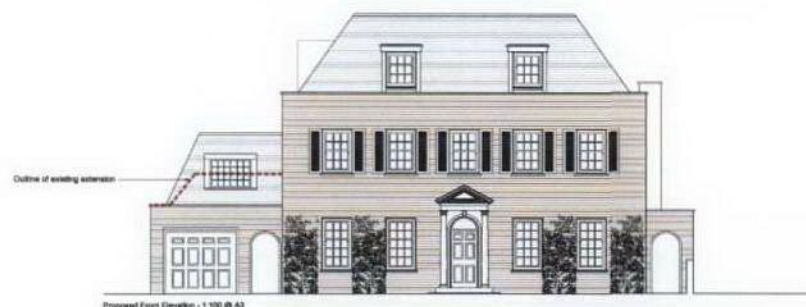
Proposed Front Elevation - 1:100 @ A3