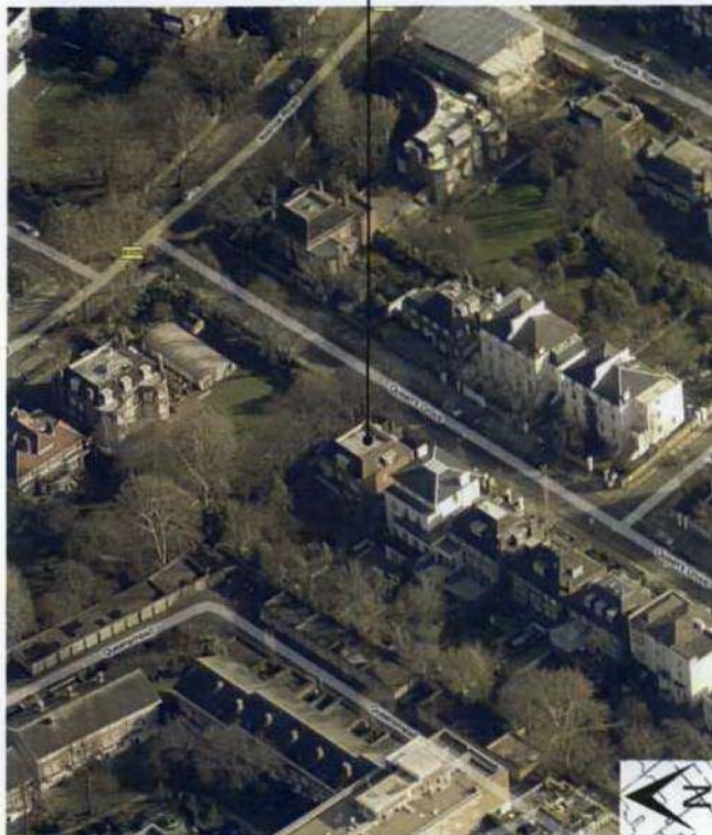
-Eastern Isometric View