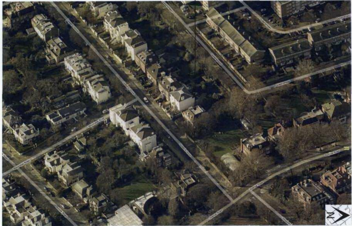
-Western Isometric View