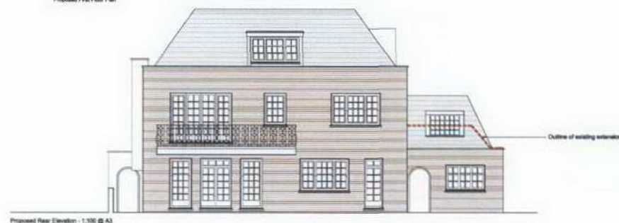
Proposed Rear Elevation - 1:100 @ A3