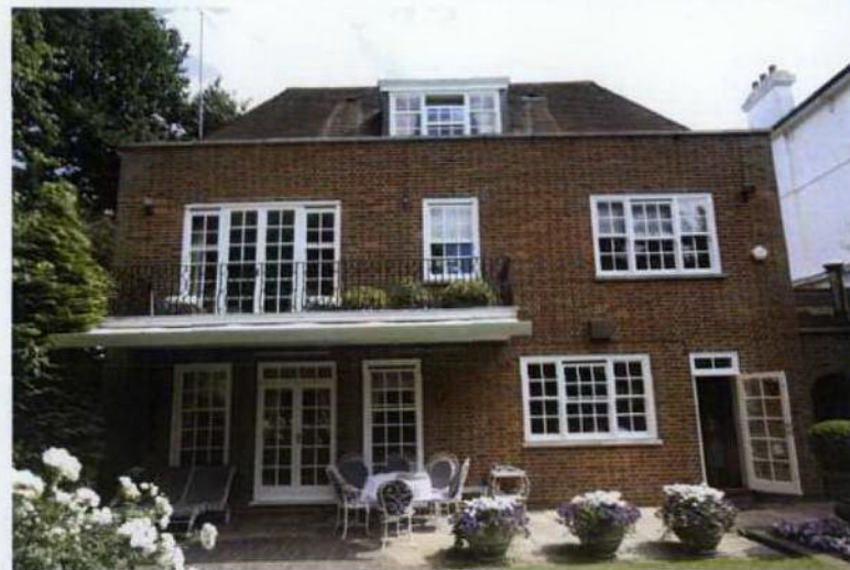
-Rear View of Main House from Garden