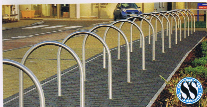
Polished stainless steel option root fixed into block paving.