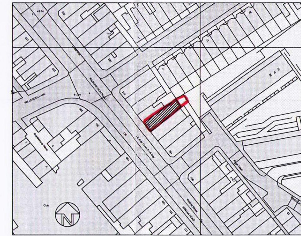
OS PLAN SCALE 1:1250

All dimensions to be verified on site by Main Contractor before the start of any shop drawings or work whatsoever either on their own behalf or that of sub-contractors. Report any discrepancies to the Contract Administrator at once. This drawing is to be read with all relevant Architect's and Engineer's drawings and other relevant information.