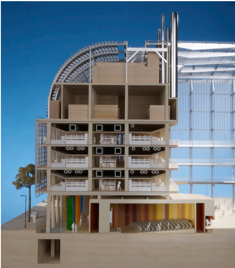
Fig 7-12. Section model

7. 21 This creates a contrast for someone looking at the building. Locally the roof is not visible because it disappears at the parapet line of the laboratory floors. Further away, the silhouette of the Institute becomes apparent. At a distance the building has a strong identity but locally its scale is appropriate to its surroundings.