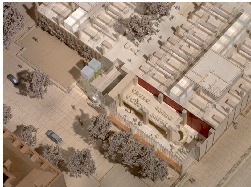
Fig 6-17. Model of West massing including the community space and Ossulston staff entrance

The Ossulston Street entrance helps to pull the atrium through the building and activate the west side of the building. Pulling the southern wing back to the building line on Ossulston Street has created room for a two storey space that will be offered to the community as a neighbourhood facility.