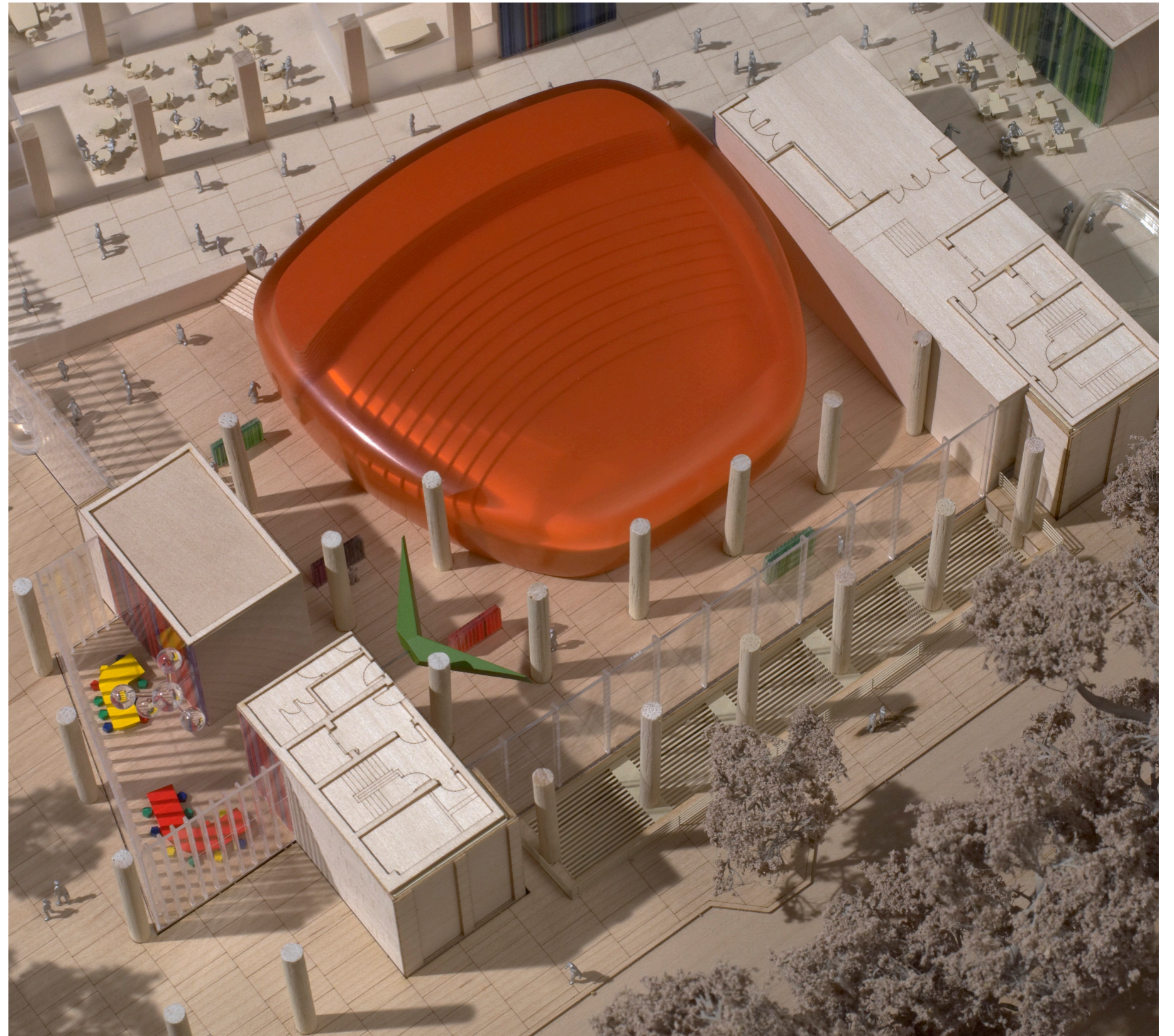
Fig 6-12. Diagrammatic model view of teaching laboratory, auditorium and exhibition space