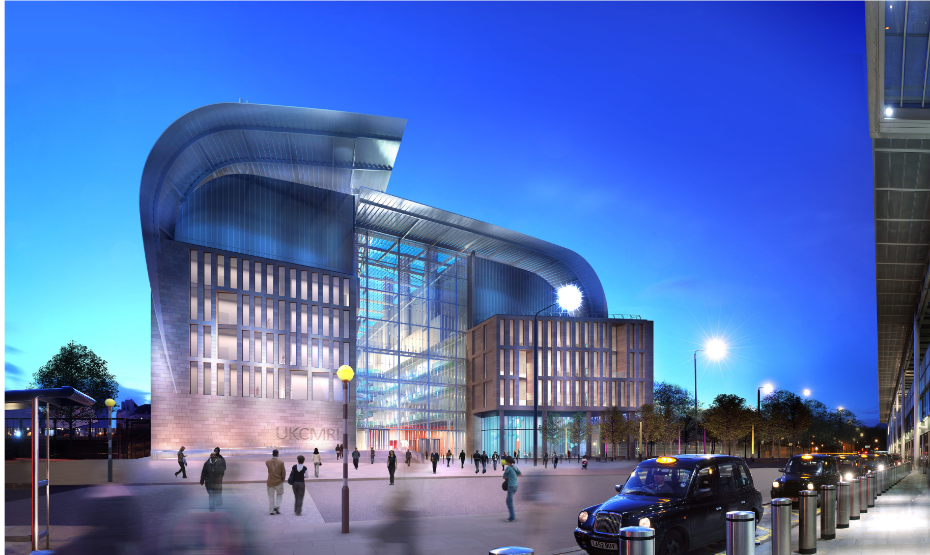
Fig 6-5. Indicative view looking at Midland Road entrance