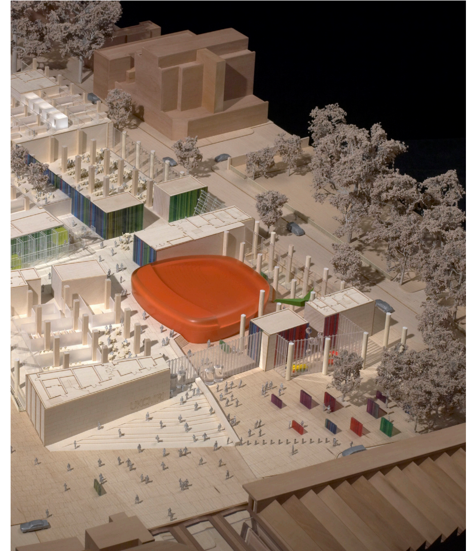
Fig 6-6. Model of public realm and visually permeable ground floor. Diagrammatic representation