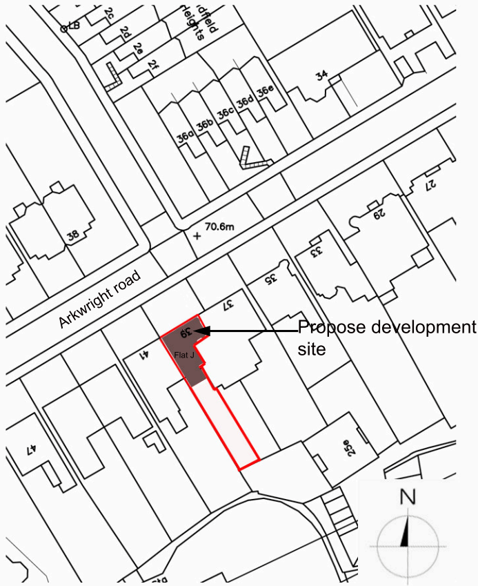
Location plan 1:1250