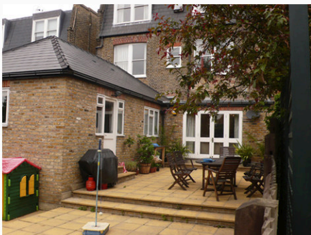
Rear view of No41