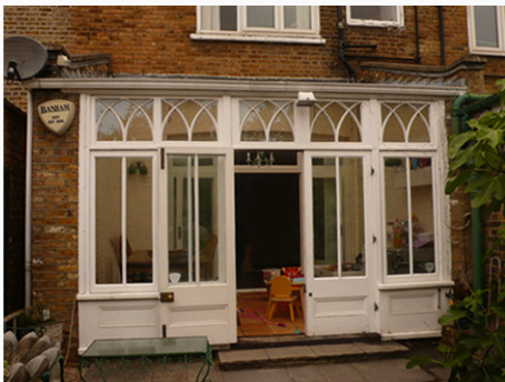
Rear view of Site(flat J)