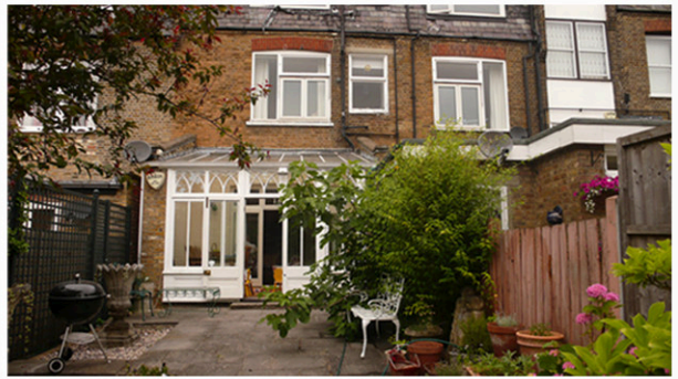
Rear view of Flat J & M

The drawings and the design hereon is the copyright of Milan Babic Architects Ltd and must not be reproduced without their written consent.