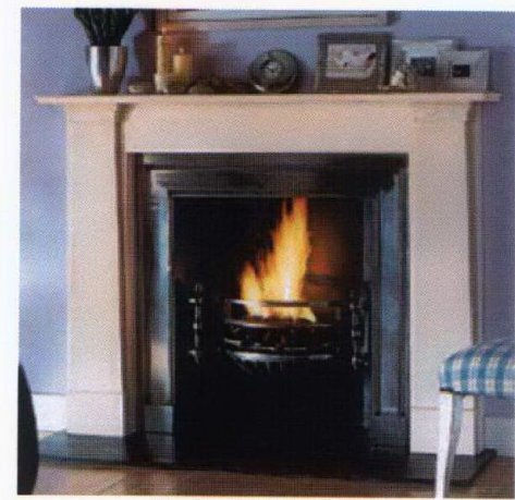
THOMAS HOPE 40