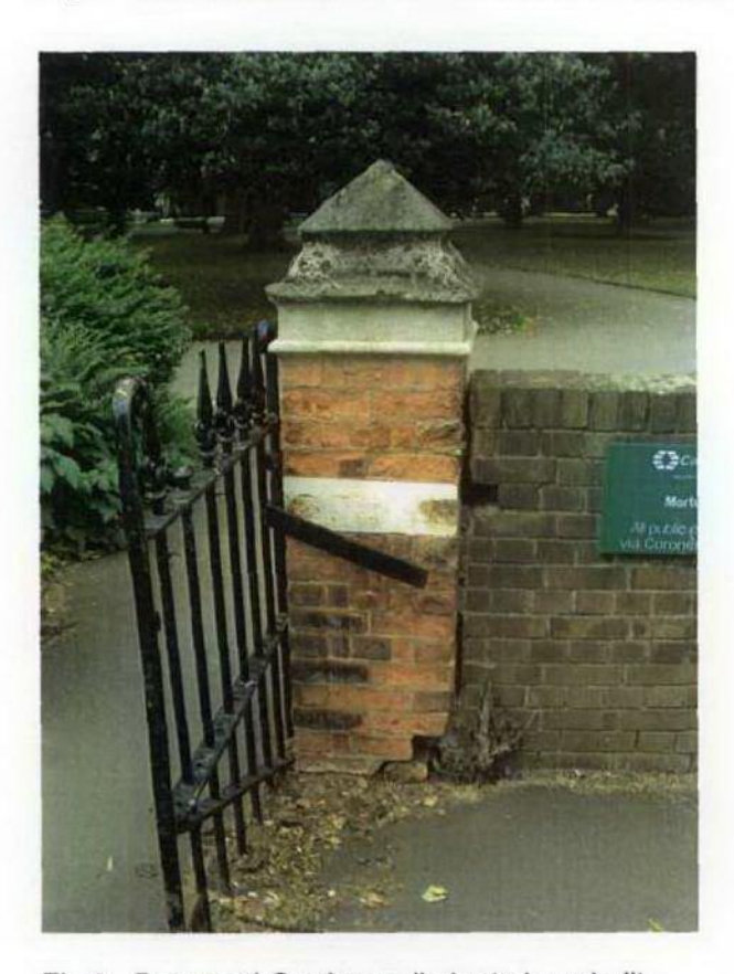
Fig 2 - Proposed Garden wall pier to be rebuilt