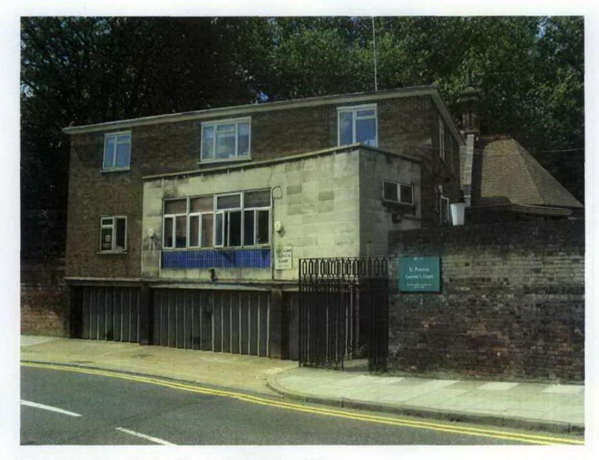
Fig 3 - View from Camley Street of 1950/60s addition