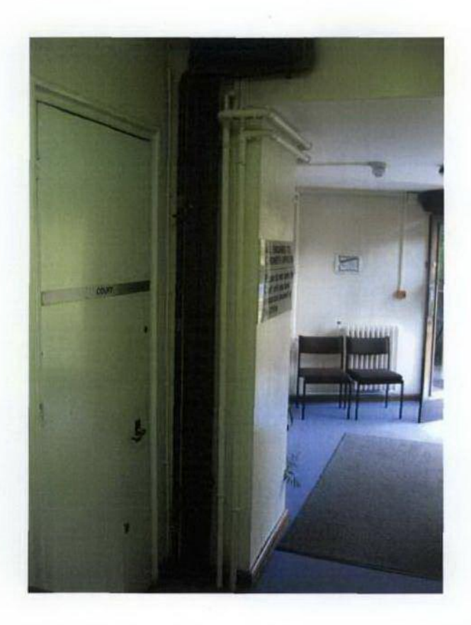
Fig 4 - Proposed Internal wall to be panelled to cover services