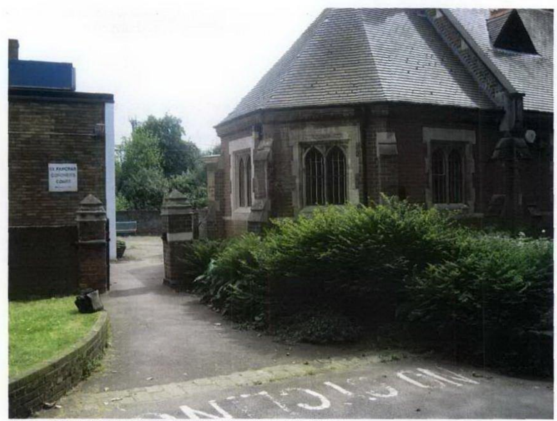
Fig 1 - View of external area between Court and Mortuary