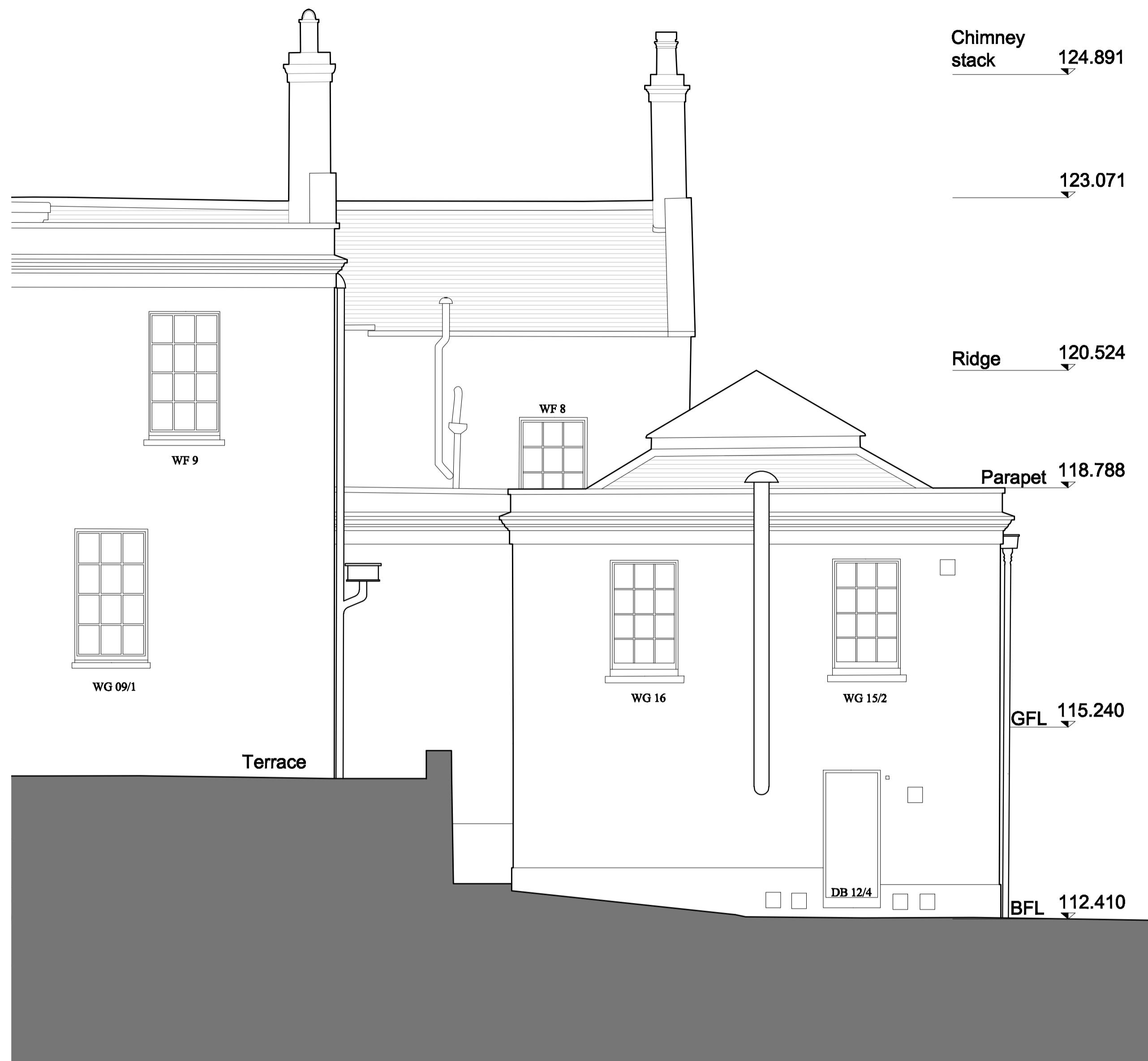
SECTION B-B AS EXISTING