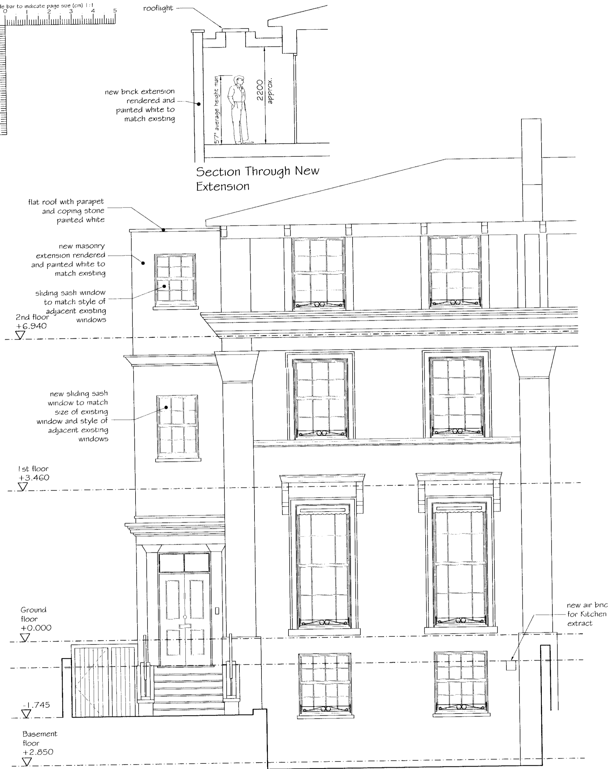
Proposed Front Elevation A - Scale 1:50