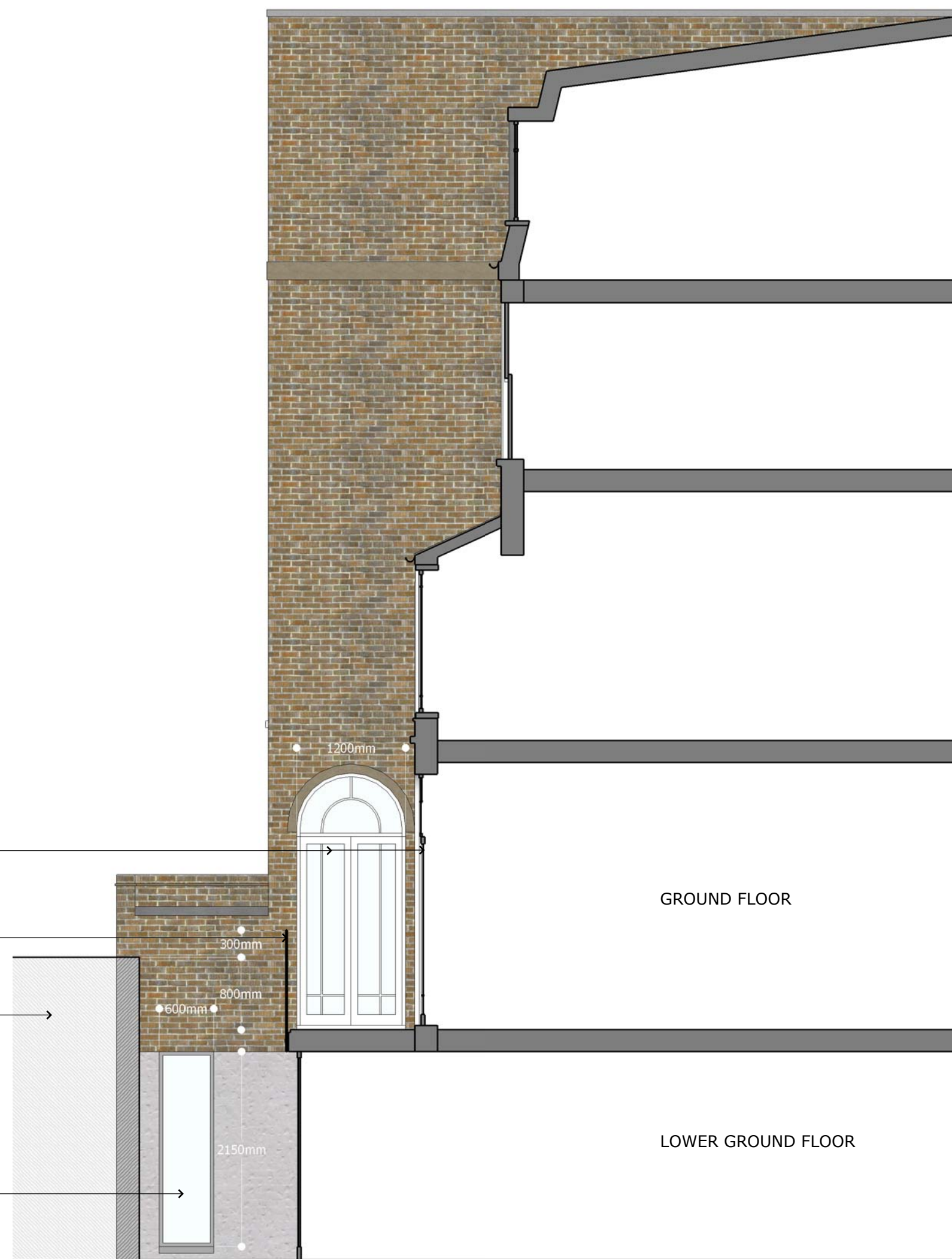
2 Proposed section AA 1:50