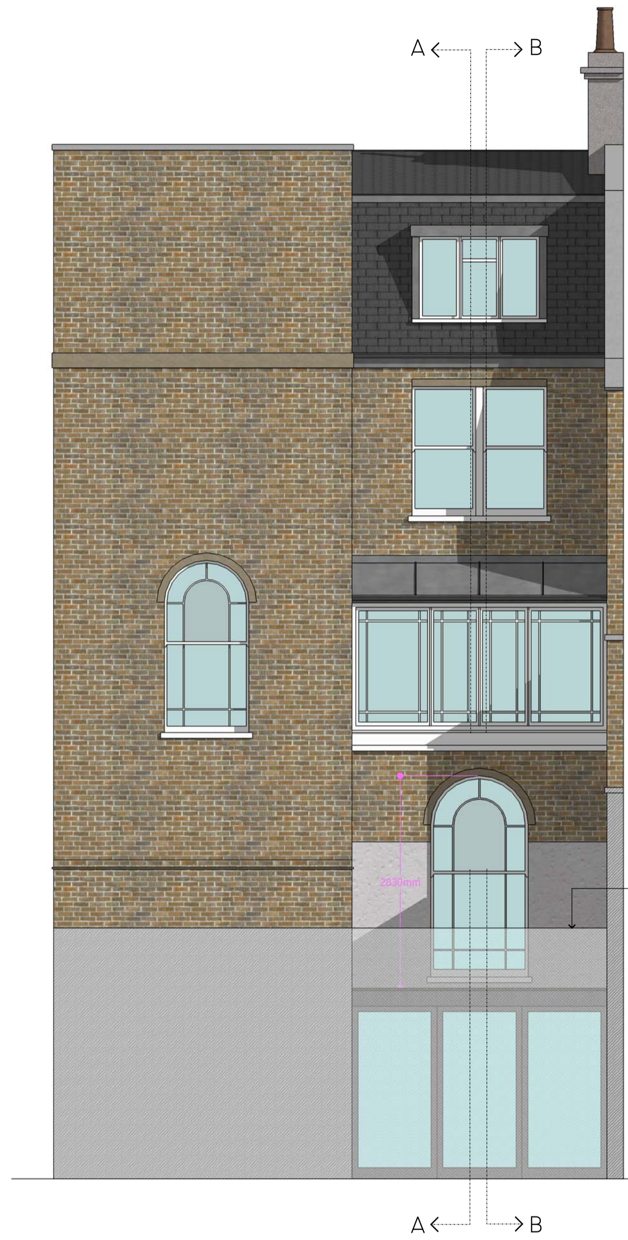
1 Existing rear elevation 1:50