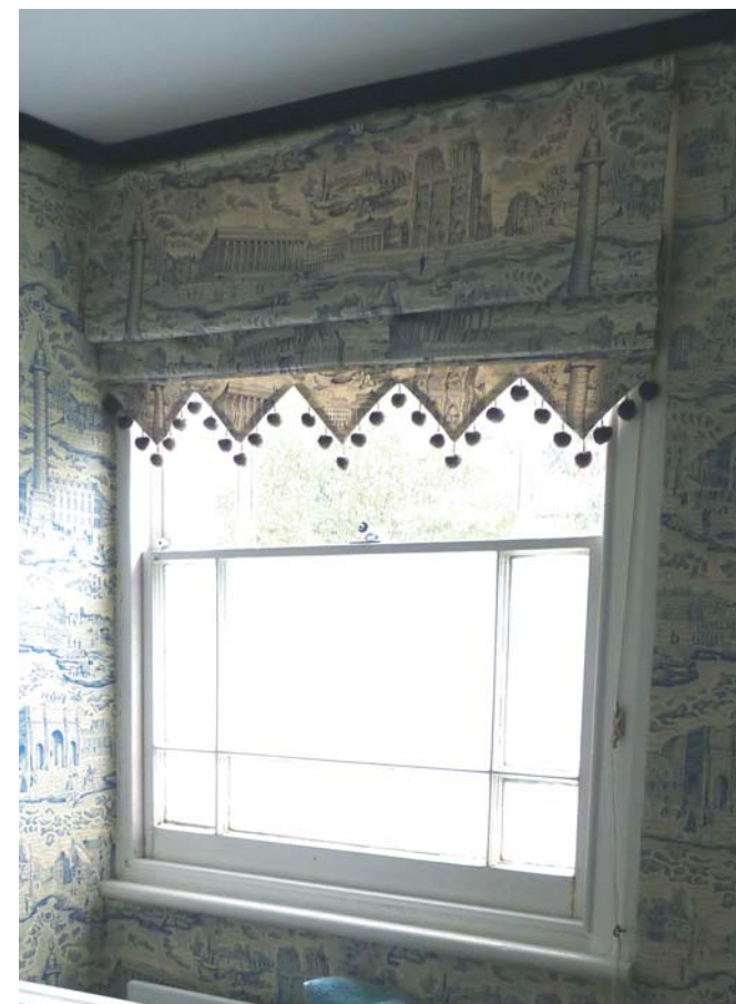
EXISTING WINDOW (TO BE RETAINED) INSIDE W.C.