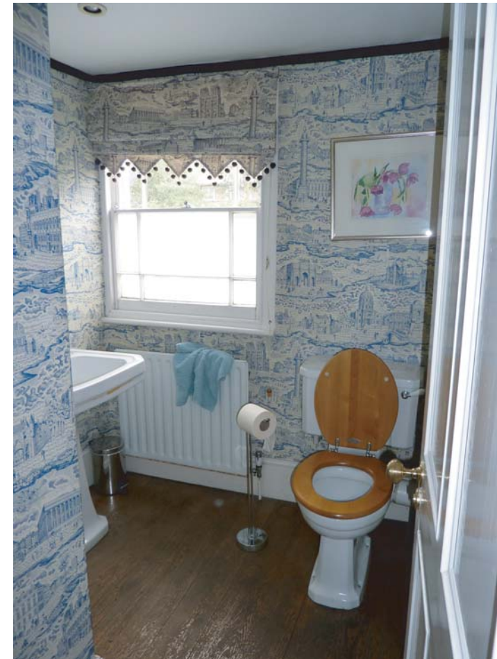
VIEW INSIDE EXISTING W.C.