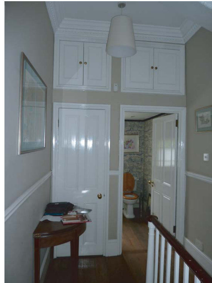
VIEW WITH W.C. DOOR OPEN