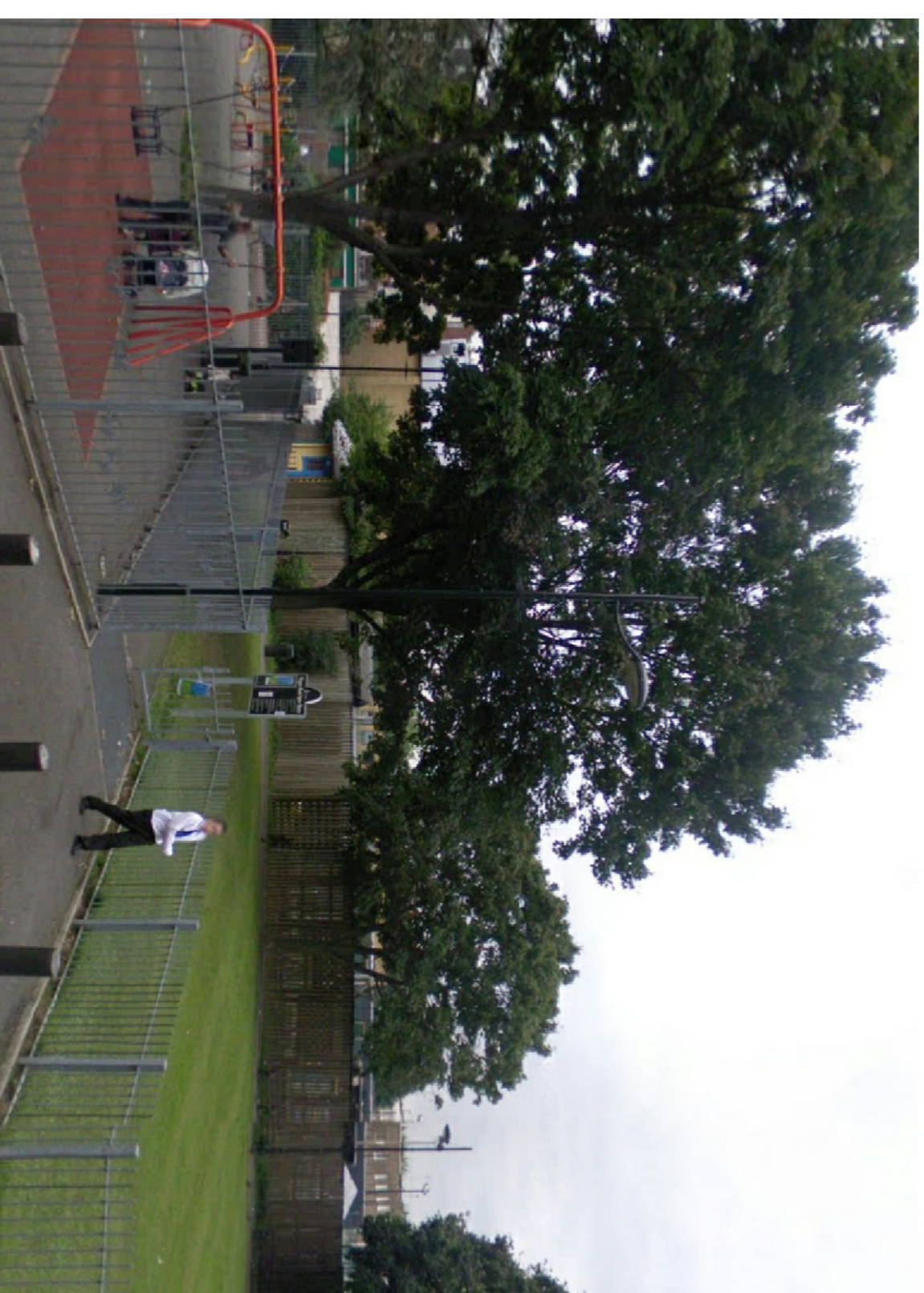
4. VIEW FROM POLYGON ROAD