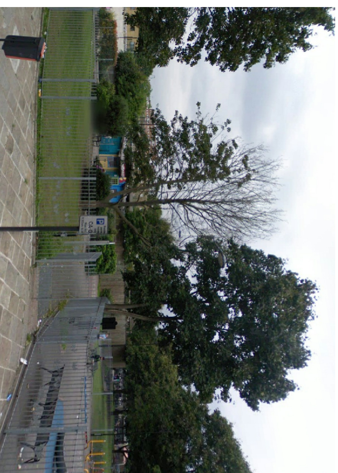
2. VIEW TOWARDS PLOT 10 ACROSS PARK FROM CHALTON STREET