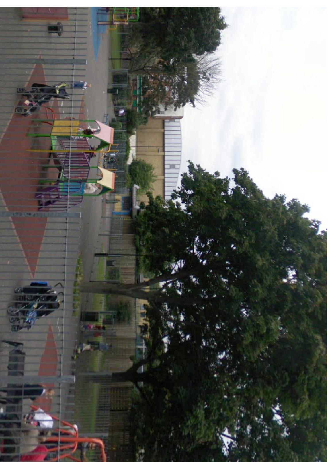
3. VIEW TOWARDS ENTRANCE OF EXISTING BUILDING FROM POLYGON ROAD