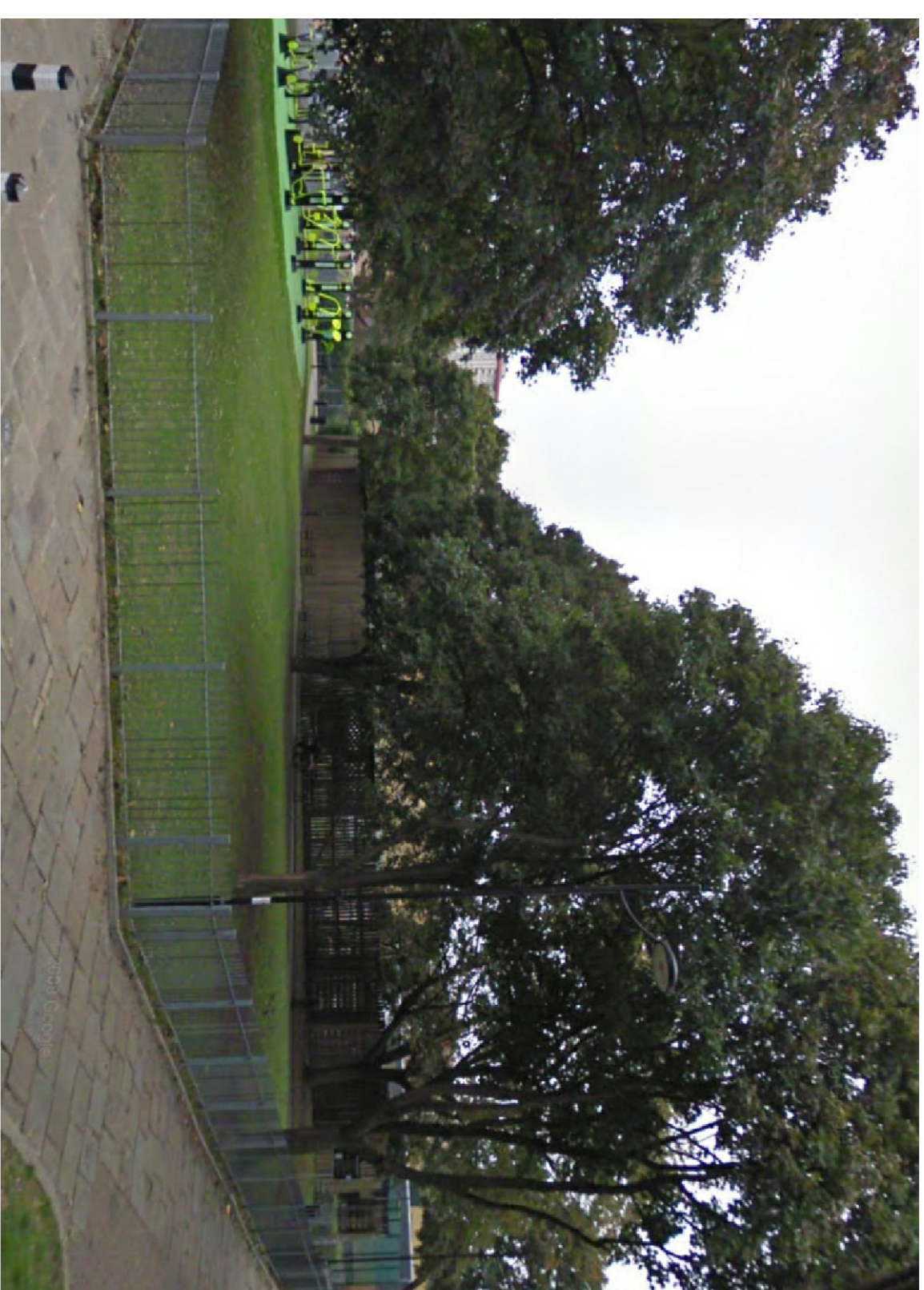
5. VIEW TOWARDS PLOT 10 FROM POLYGON ROAD