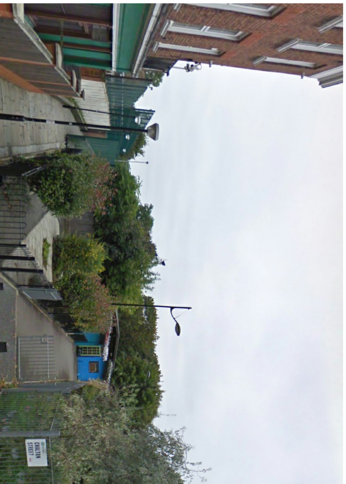
1. VIEW TOWARDS ENTRANCE OF EXISTING BUILDING FROM CHALTON STREET (PUBLIC HOUSE ON LEFT)