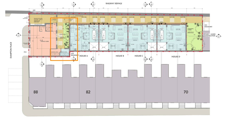
Detail Area B