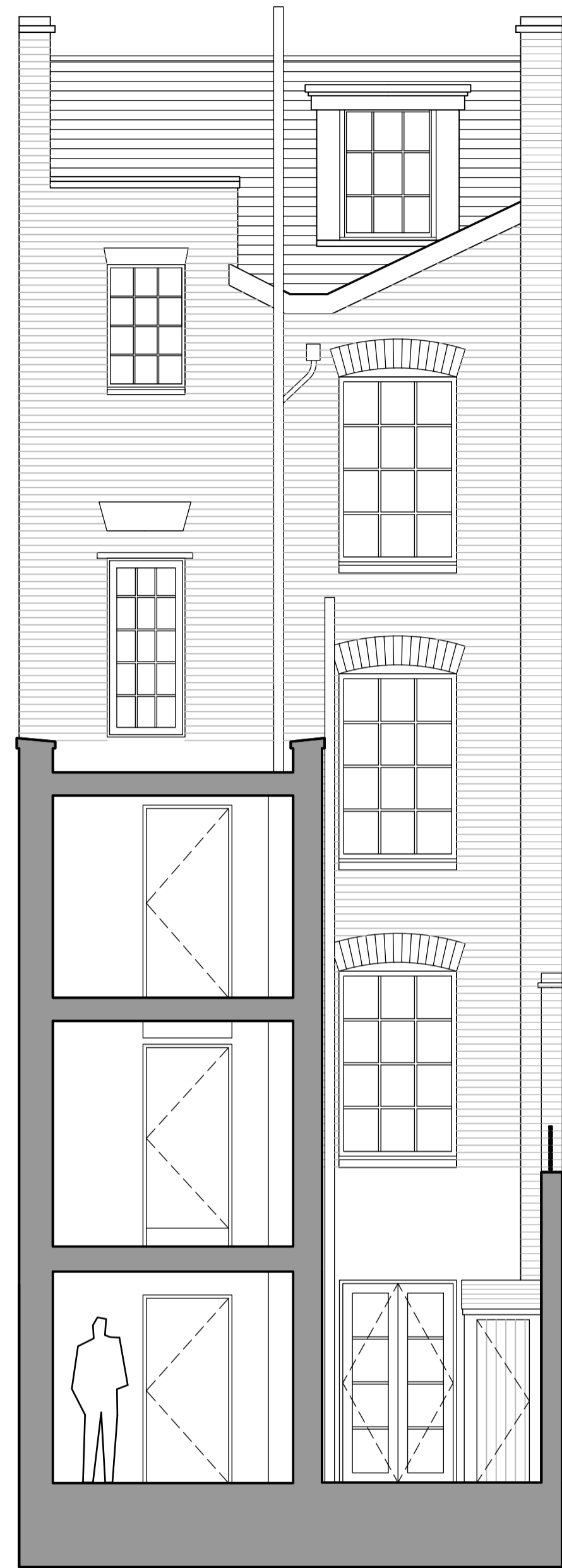
2 SECTION / ELEVATION B - B 1:50