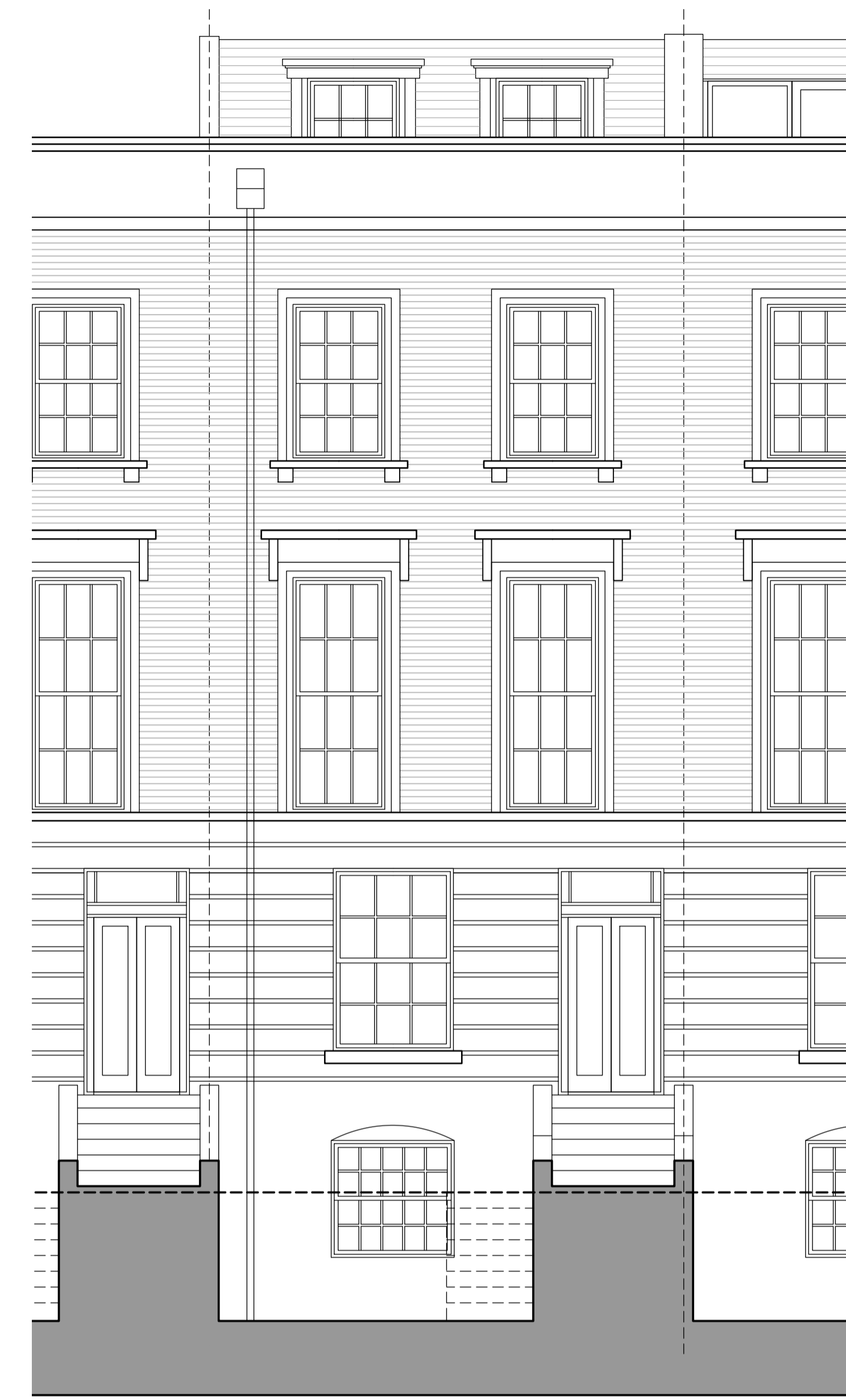
4 FRONT ELEVATION / SECTION E-E 1:50