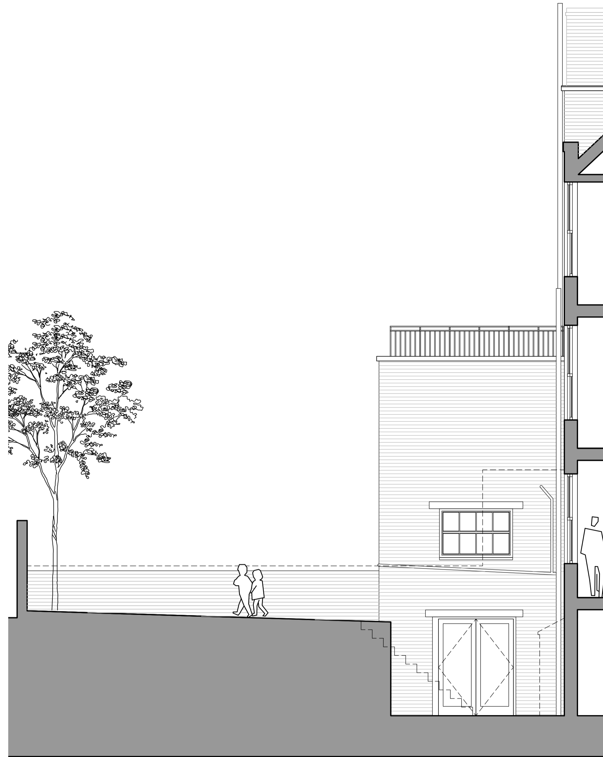
3 SECTION / ELEVATION A - A 1:50