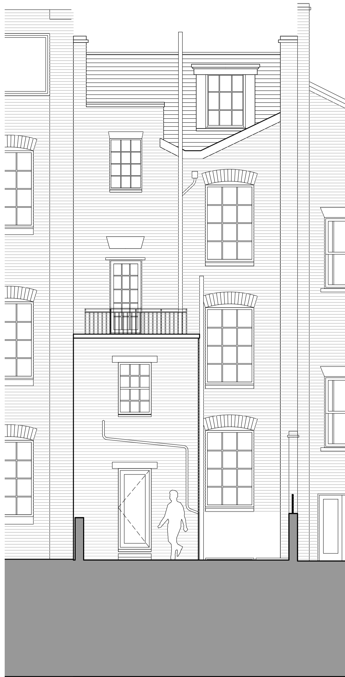
1 SECTION / ELEVATION C - C 1:50