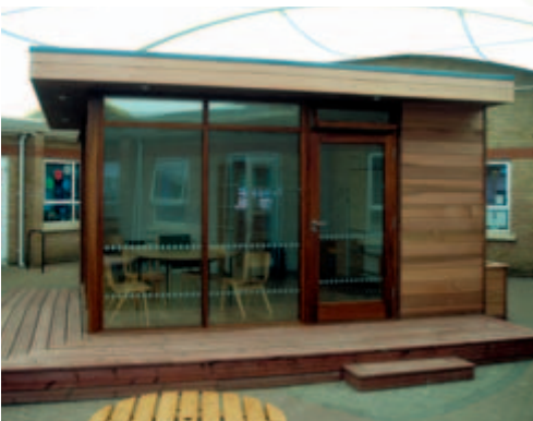
Classroom, All Saints School. March, Cambridgeshire