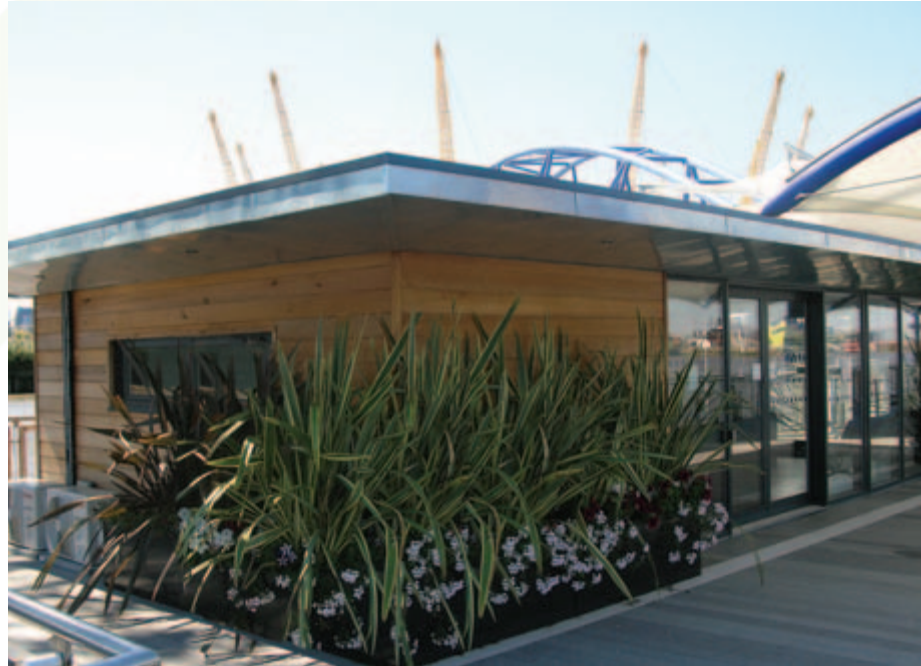
Waiting Room, 02 - Millennium Dome, London

Style and confidence mark the Commercial Garden Escape as the embodiment of professional excellence. Elegant architectural lines embrace a spacious, flexible interior that can be adapted to suit all your needs, from home to school and business. The environmentally-friendly Commercial Escape combines top-class modern ambience with classic quality, ensuring workplace satisfaction every time.