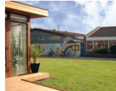
Staffroom, Hampton School, Esher

Call 0870 242 7024 to arrange a site visit and to see which Garden Escape is right for you.