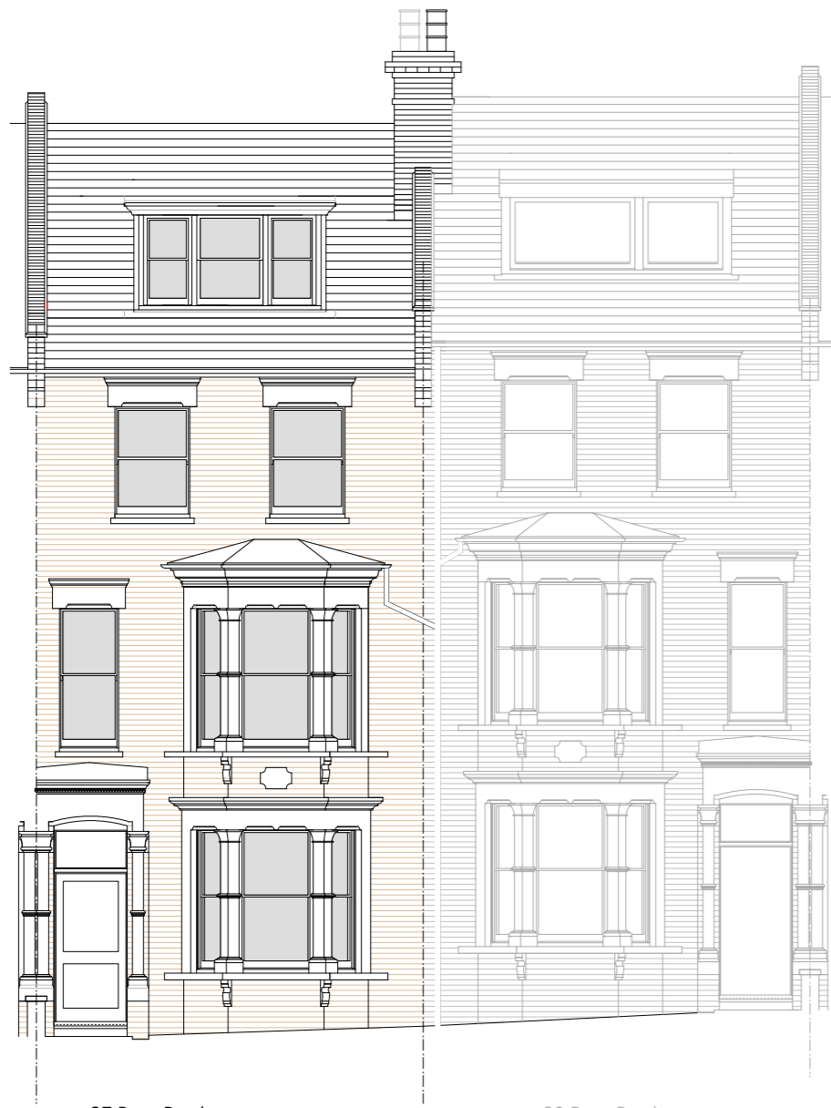
27 Rona Road