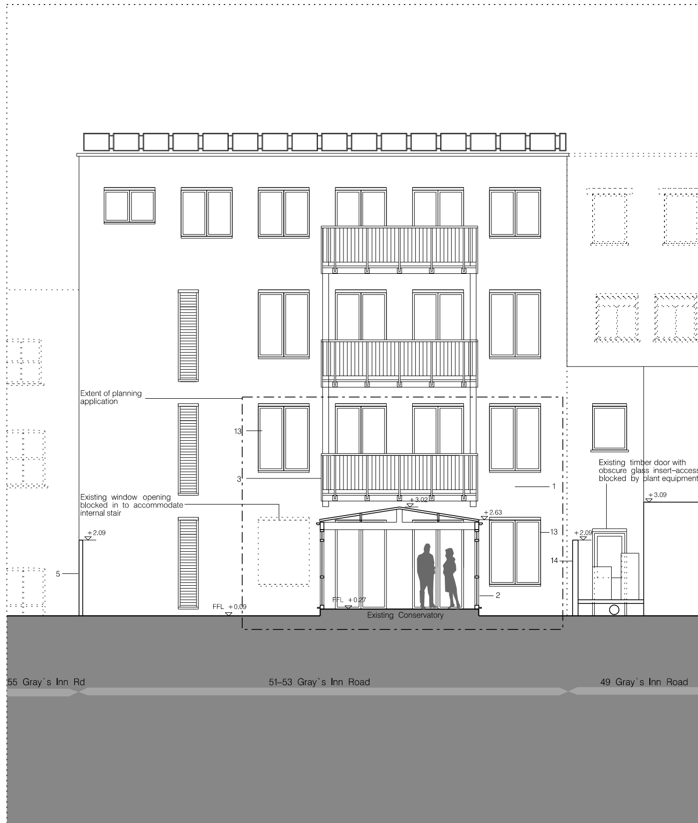
01 Approved Section A-A