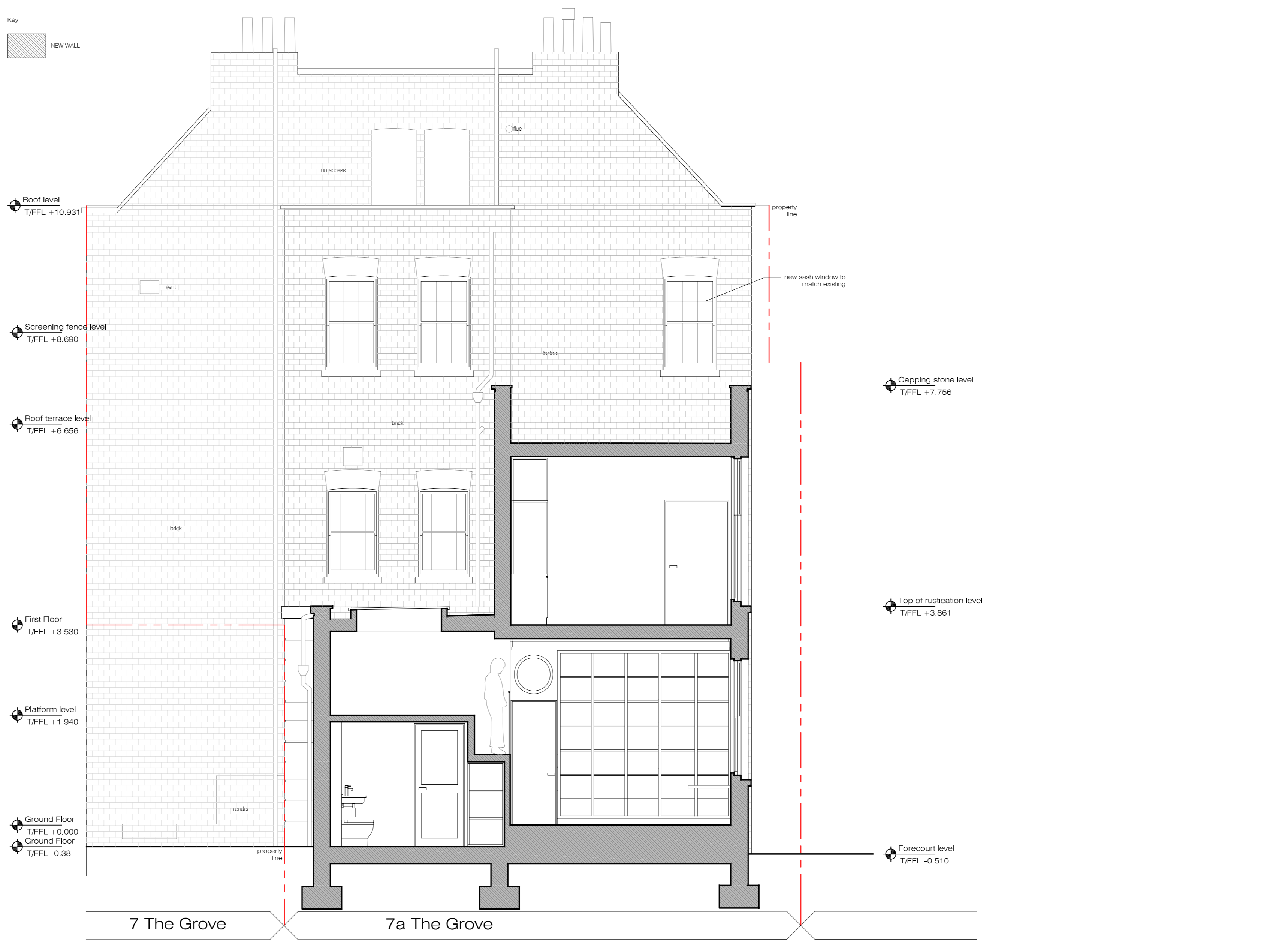
01 Proposed Section B-B scale: 1/50