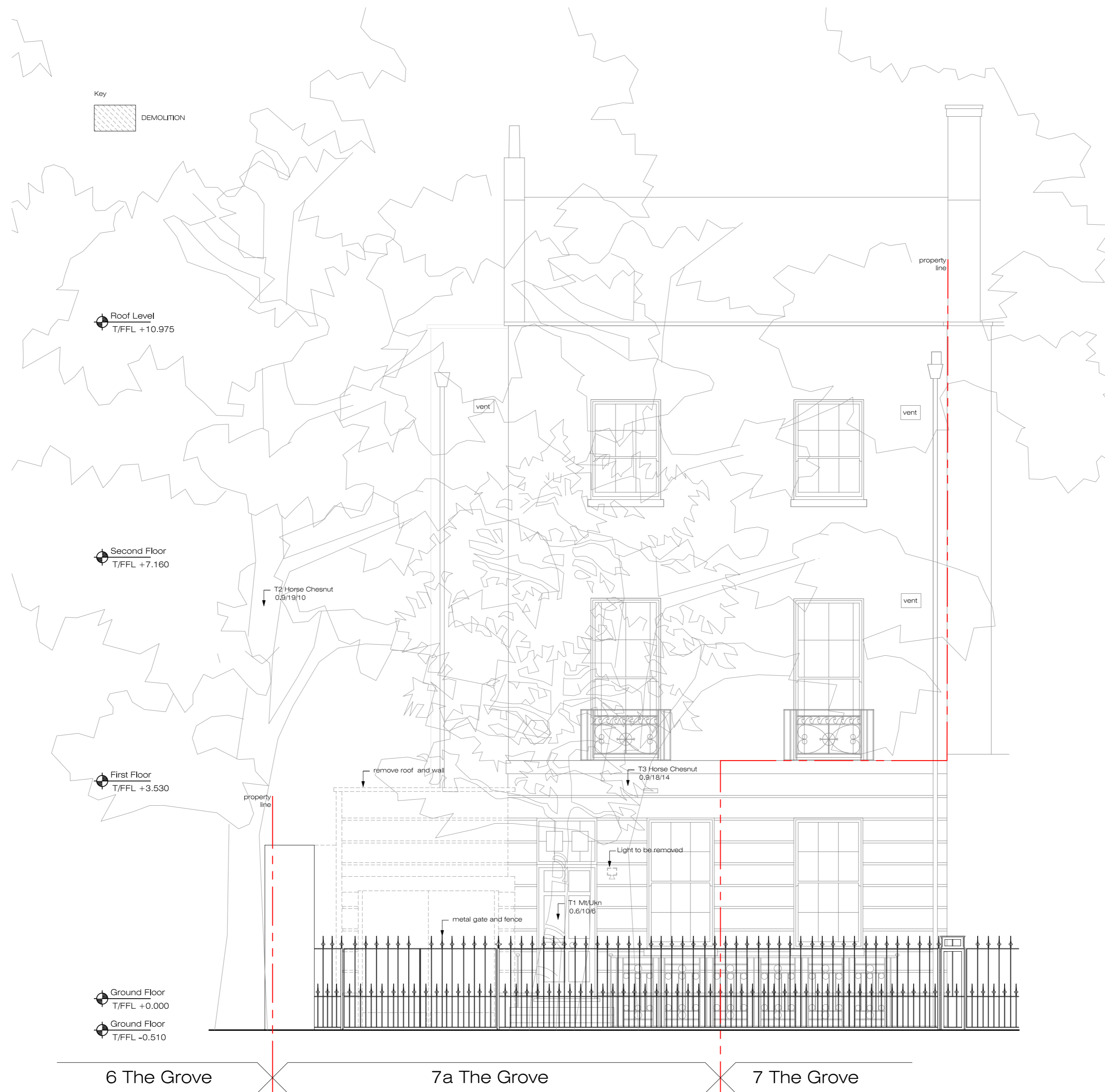
01 Existing Front Elevation from street scale: 1:50