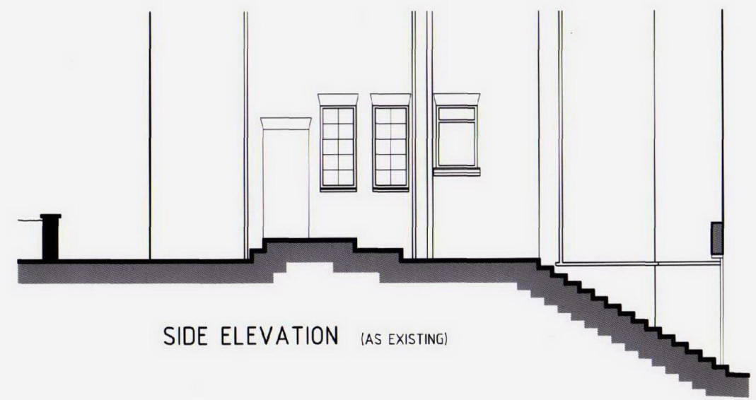
SIDE ELEVATION (AS EXISTING)