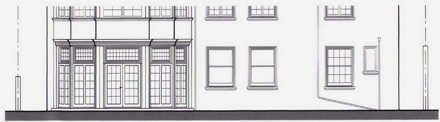
REAR ELEVATION (AS EXISTING)